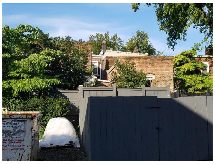
Figure 4. Rear panty enclosure, view from the alley.