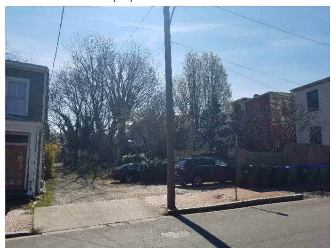
Figure 5. 411 North 22nd Street.