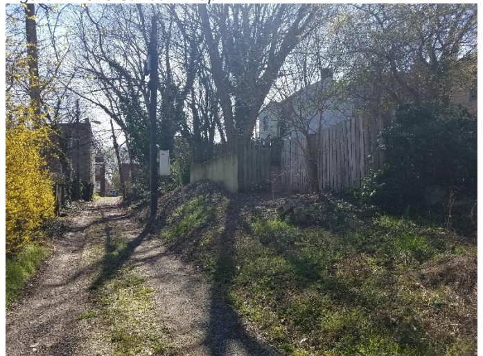
Figure 6. 411 North 22nd Street, view of rear of property from alley.