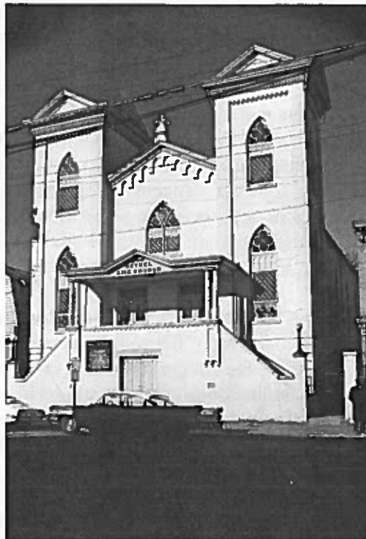
Third Street Bethel A.M.E. Church, 1974 Property of Department of Historic Resources

The Colonial Revival influence is seen in the hipped with central gable portico roof, supported on both corners by paired Doric columns. Equally as prominent, was the replacement of the Italianate-style tower roofs with intersecting pedimented gables and a classical-style cornice.