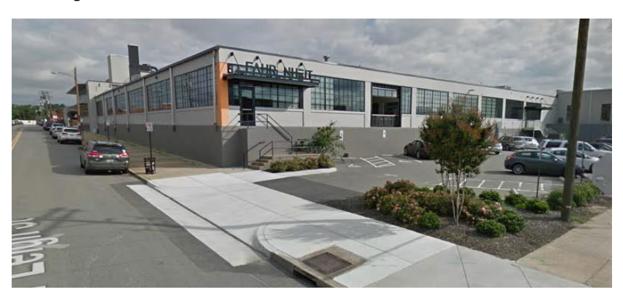
6. Tazza Kitchen @ Leigh & Roseneath Ave