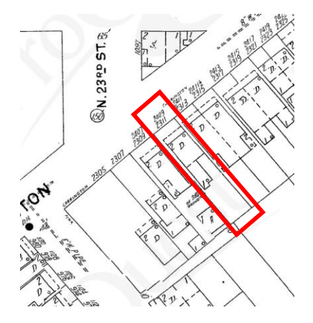
Figure 2. 1950 Sanborn map, note address changes.