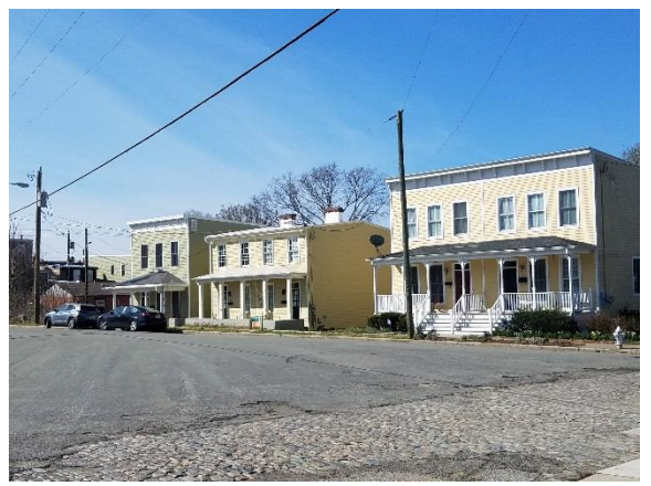
Figure 6. 966, 970-972, and 976-978 Pink Street.