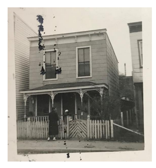
Figure 3. 2311 Carrington Street, assessor photograph.