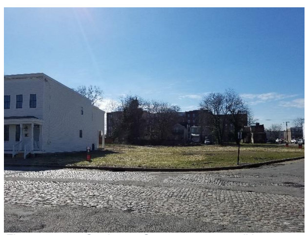
Figure 4. 2311 Carrington Street, current conditions.