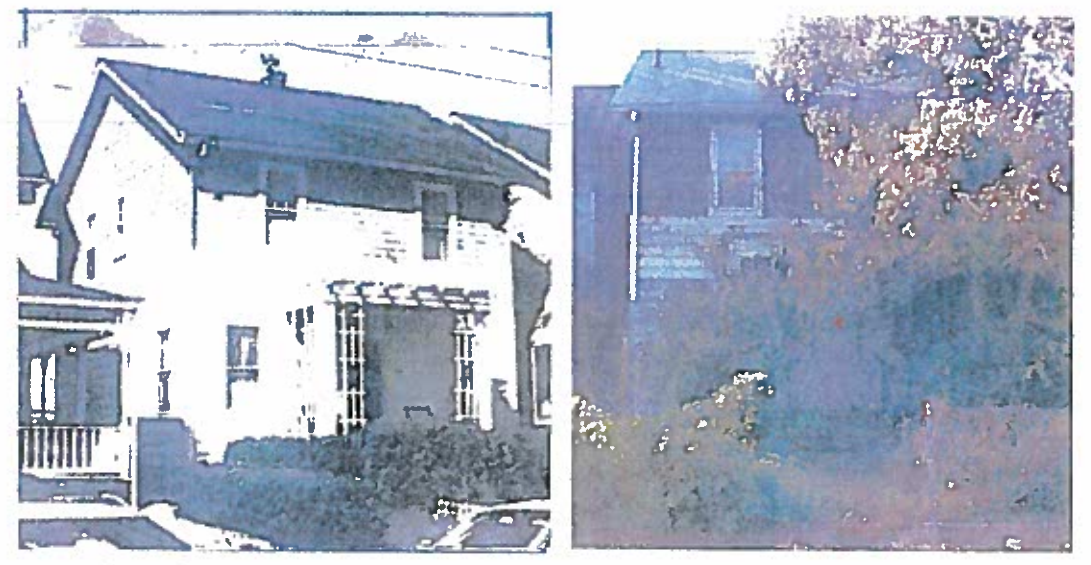
1980s Historic Richmond survey photo