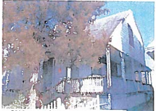
1980s Historic Richmond survey photo