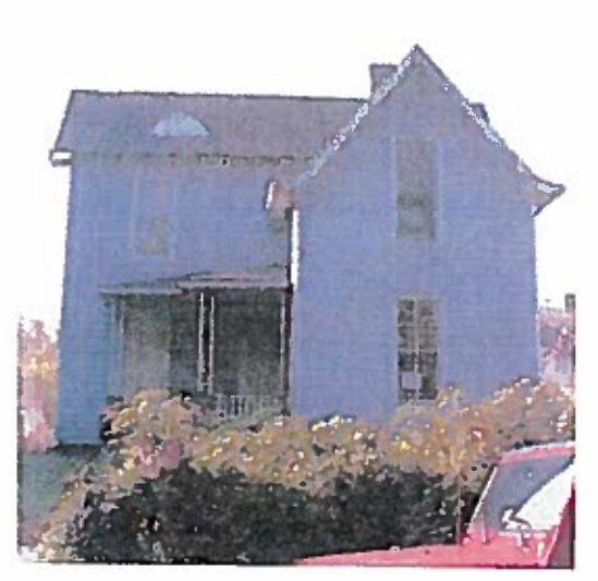
2016 survey photo.

The Late Victorian style buildings in Barton Heights are typically wood frame, detached, single family houses with steep pitched gable roofs covered with standing-seam metal. In contrast to the Queen Anne style houses found in the neighborhood, these are more vertically oriented, with less exuberant detail. In Barton Heights there are only two rows of Late Victorian style houses, as well as a few other isolated examples. A group of small-scale, L-shaped, Late Victorian houses can be found in a single block of Sewell Street: 1600, 1604, 1606, 1610, and 1614 Sewell Street, all constructed circa 1890. The condition of these houses vary from demolished (1604 Sewell) to recently rehabilitated (1614 Sewell).