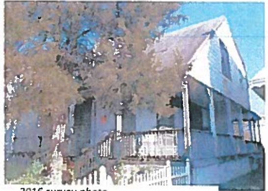
2016 survey photo.

As initially developed, the streets of Barton Heights were lined with wood frame houses with complex roof forms, angled bays, and wrap-around porches with turrets, spindle friezes and neoclassical columns. Monteiro, Barton, and Lamb Avenues boast several outstanding examples of the Queen Anne style.