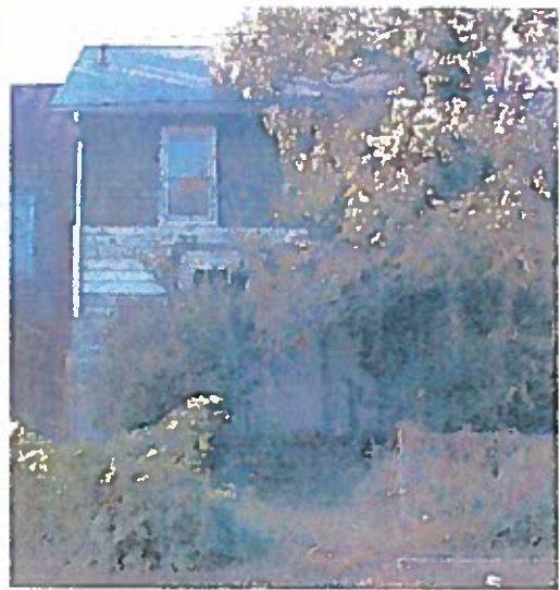
1980s Historic Richmond survey photo