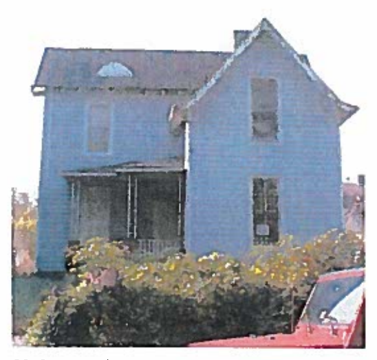
2016 survey photo.

The Late Victorian style buildings in Barton Heights are typically wood frame, detached, single family houses with steep pitched gable roofs covered with standing-seam metal. In contrast to the Queen Anne style houses found in the neighborhood, these are more vertically oriented, with less exuberant detail. In Barton Heights there are only two rows of Late Victorian style houses, as well as a few other isolated examples. A group of small-scale, L-shaped, Late Victorian houses can be found in a single block of Sewell Street: 1600, 1604, 1606, 1610, and 1614 Sewell Street, all constructed circa 1890. The condition of these houses vary from demolished (1604 Sewell) to recently rehabilitated (1614 Sewell).