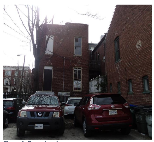
Figure 3. Rear elevation