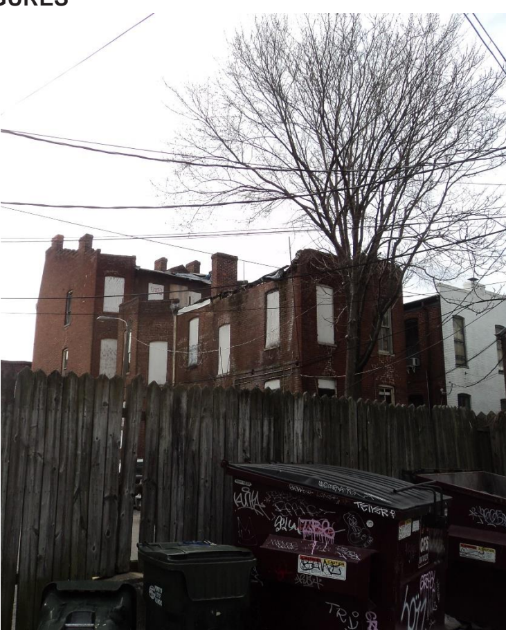
Figure 2. Current view of rear and side elevation