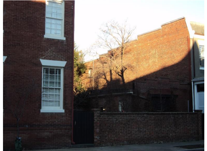
Figure 6. View of garage openings from Park Avenue