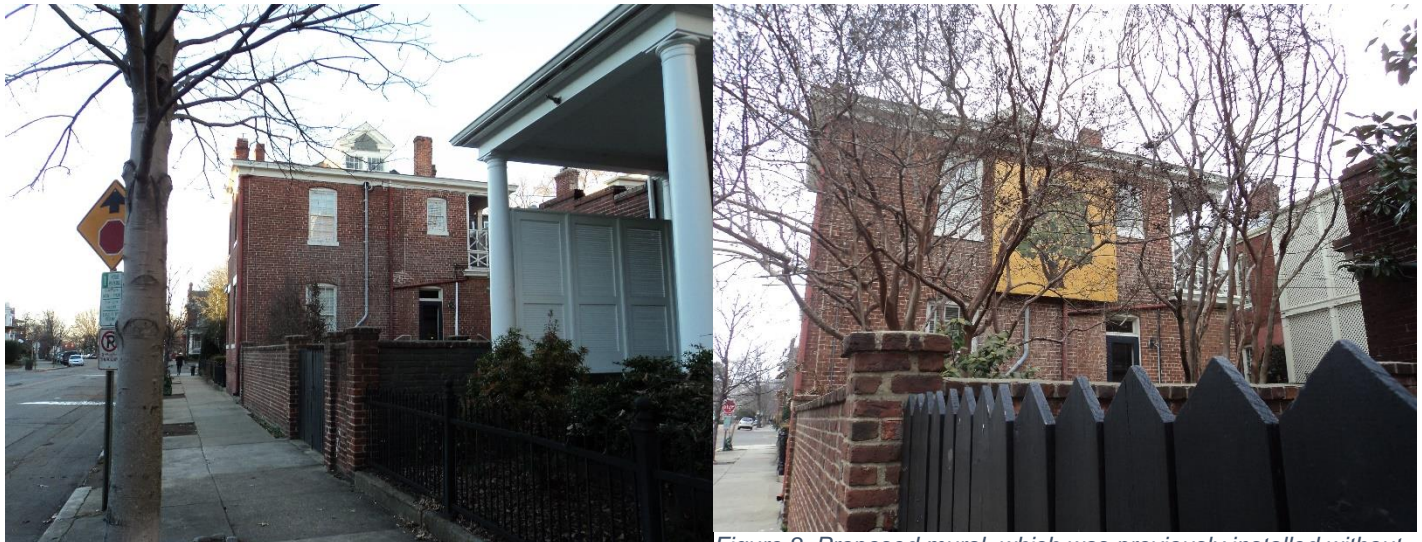
Figure 7. East elevation