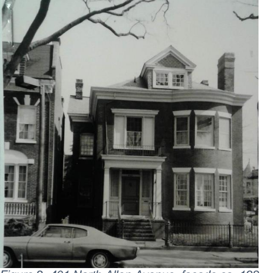
Figure 2. 401 North Allen Avenue, façade ca. 1980