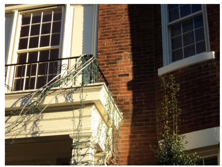
Figure 4. Ghosting of roof balustrade