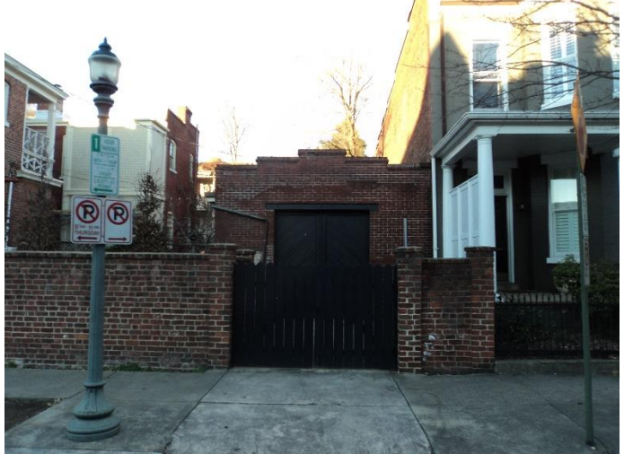
Figure 5. Existing garage and gate