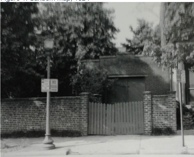
Figure 3. 401 North Allen Avenue, ca. 1980, garage in rear