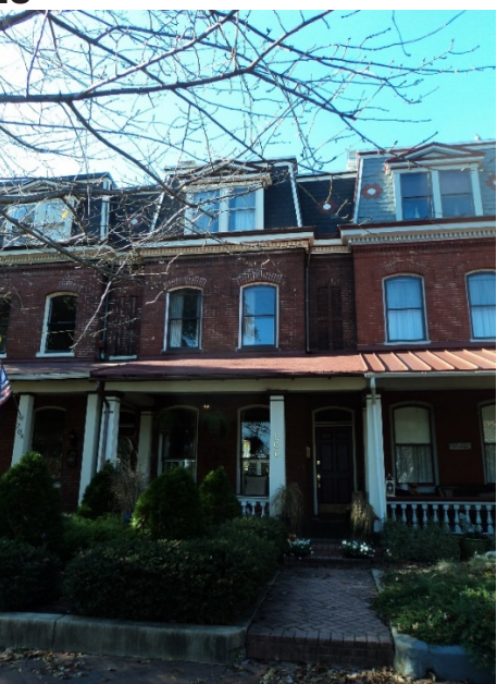
Figure 2. Facade of main building.