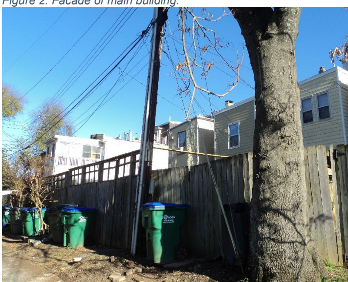
Figure 4. View of home rear alley.