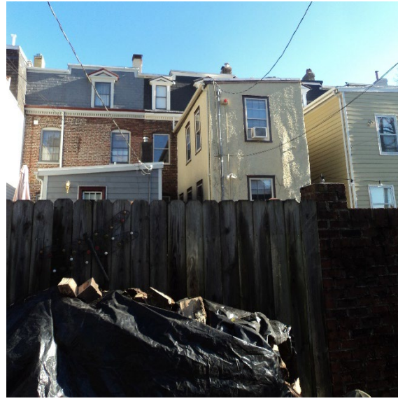
Figure 3. View of home from rear.