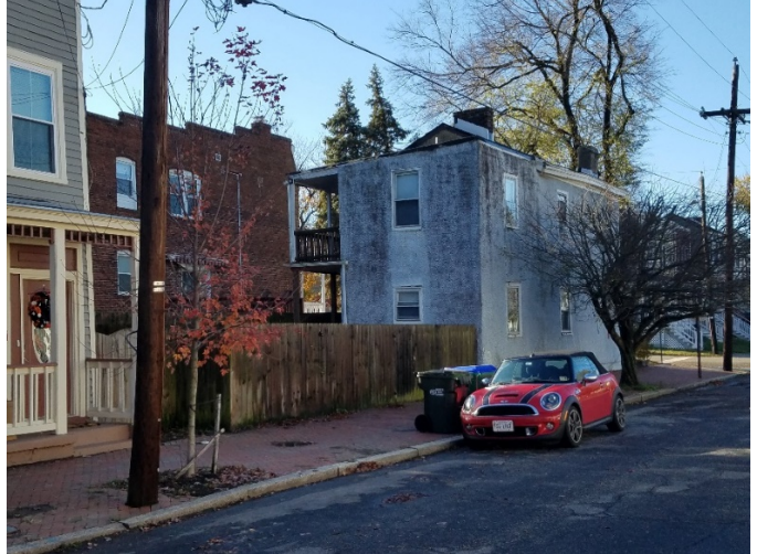
Figure 5. 2800 East Leigh Street, rear elevation, 2018.