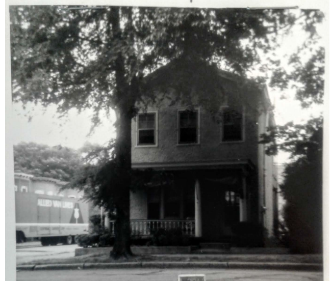
Figure 3. 2800 East Leigh Street, ca. 1977.