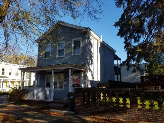
Figure 4. 2800 East Leigh Street, 2018.