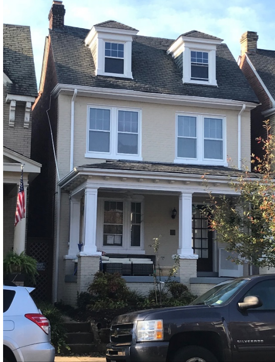
Figure 3. Existing front elevation of structure.