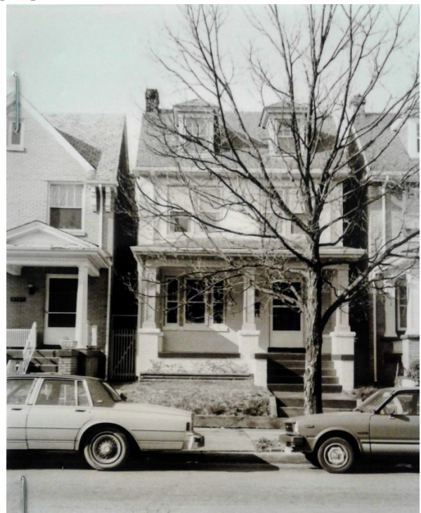
Figure 2. Front elevation of structure 1985.