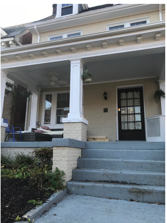
Figure 4. Existing front porch