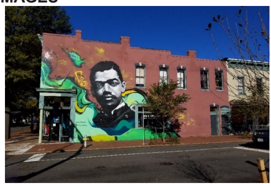
Figure 2. View of Mural looking west.