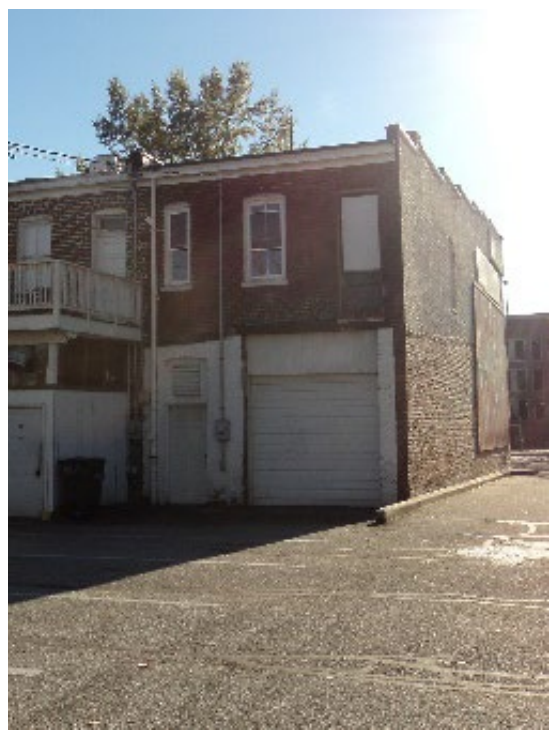
Figure 7. Rear of 508 W. Broad Street.