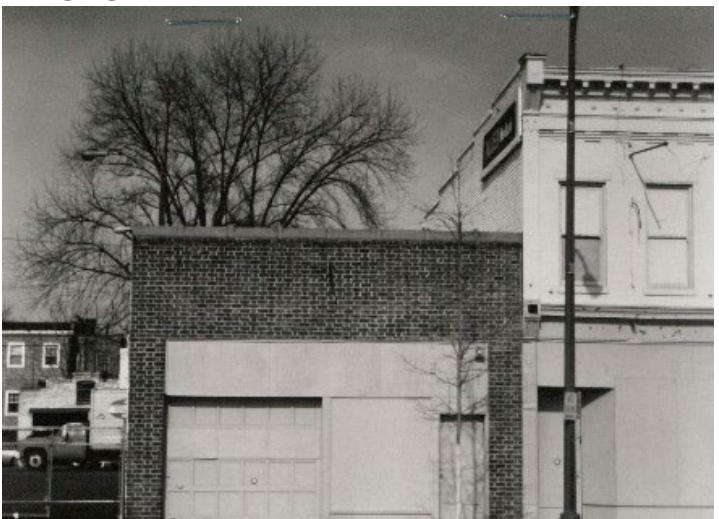
Figure 2. Building at 510 West Broad Street, 1992.