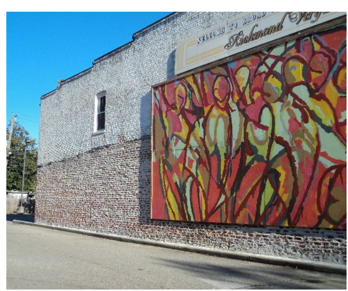
Figure 4. Side wall, 508 W. Broad Street