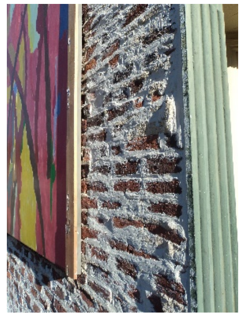
Figure 5. Side wall detail.