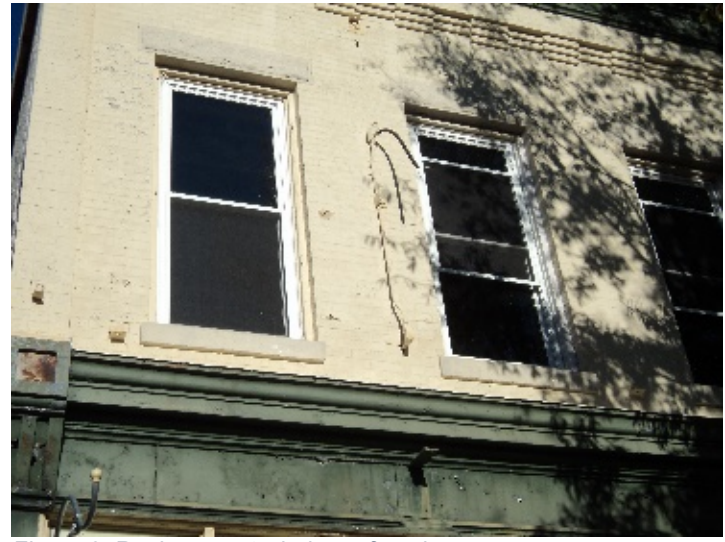
Figure 6. Replacement windows, facade.