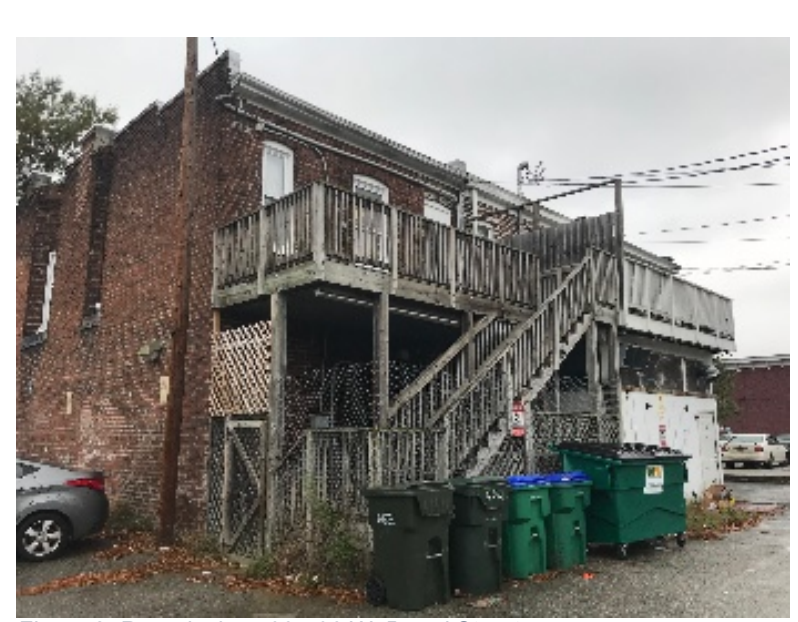
Figure 8. Rear decks, 500-506 W. Broad Street.