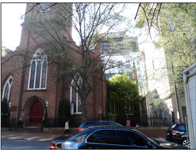
Figure 2. Existing Glass Atrium and Church Corner, April 2018.