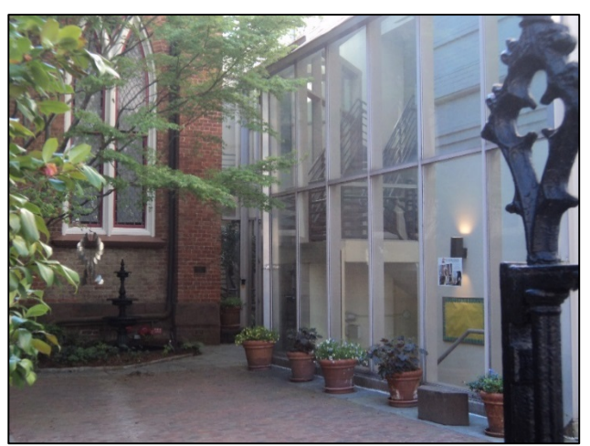
Figure 3. Existing Glass Atrium and Church Corner Detail, April 2018.