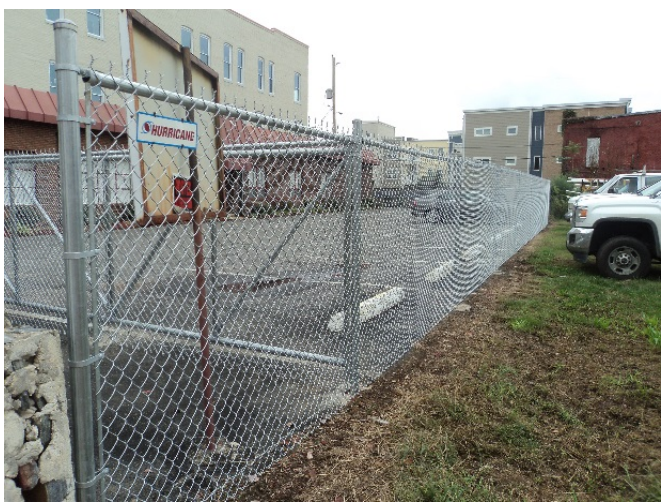
Figure 2. Installed fence, view of side yard.