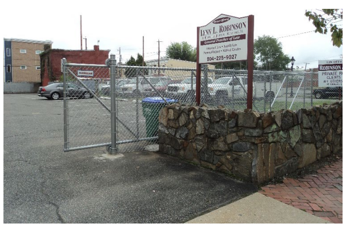
Figure 1. Installed chain-link fence, view from West Leigh Street.