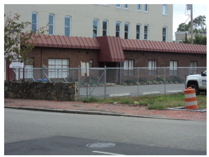
Figure 3. Installed fence, view from across West Leigh Street.