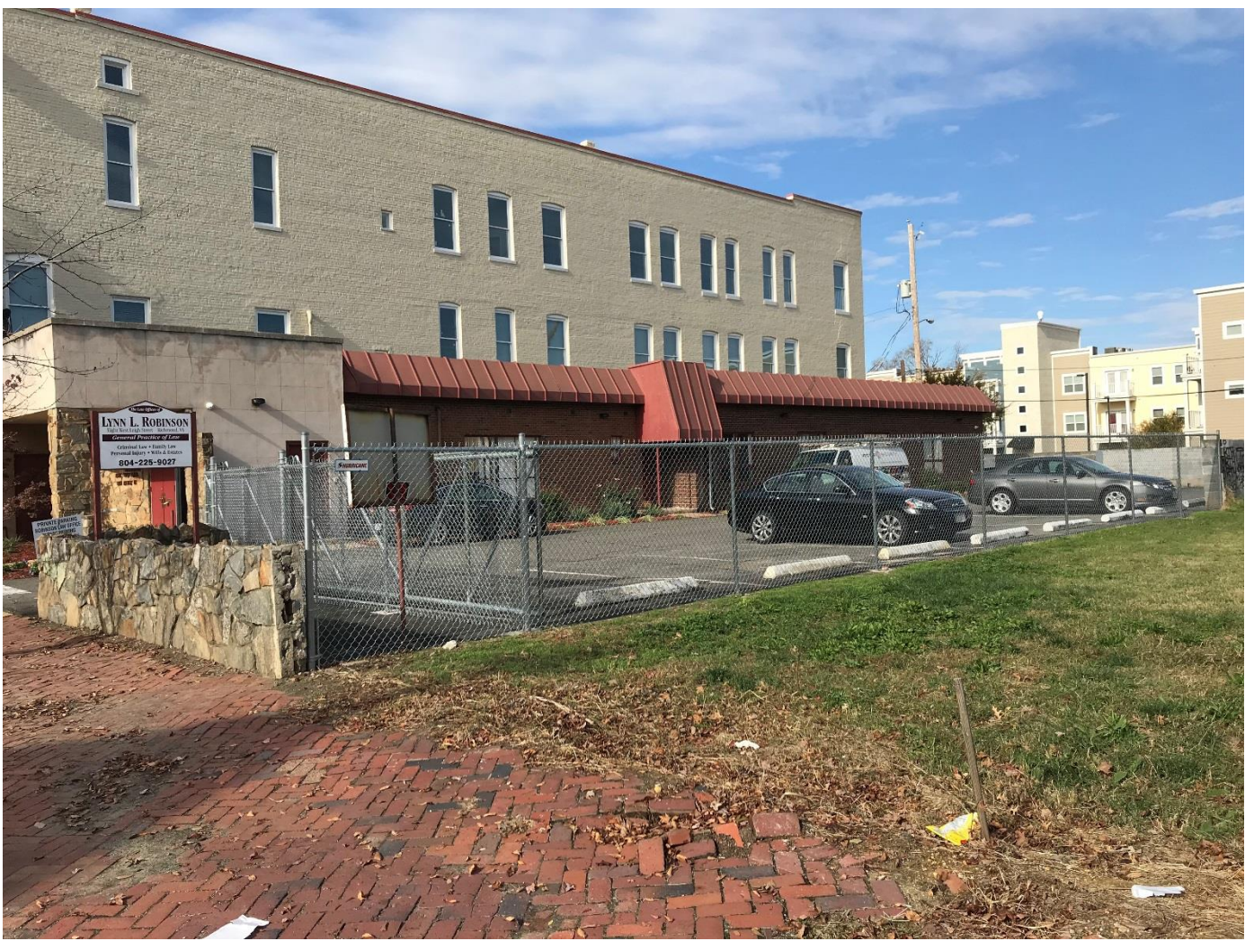
The fence is 6 feet tall.