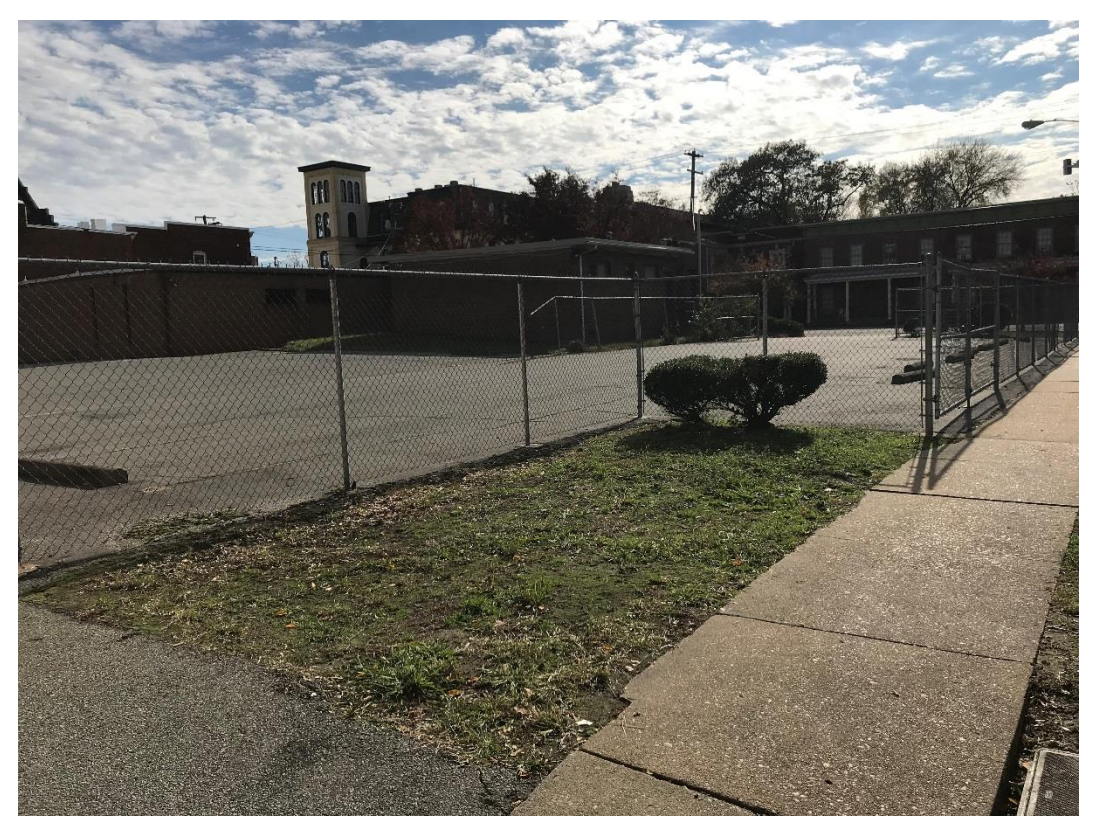
The fence is 6 feet tall.