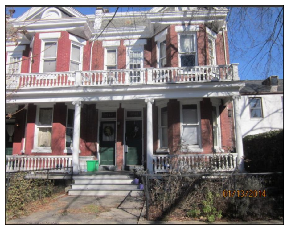
2712 East Broad Street, 2014.

The new gutters appear to be vinyl with plastic downspouts and are installed directly below the porch roof cornice line. The gutters project past the cornice line at either end of the porch roof. At the outer bay of 2712 East Broad a downspout was installed on the front of the outermost column.