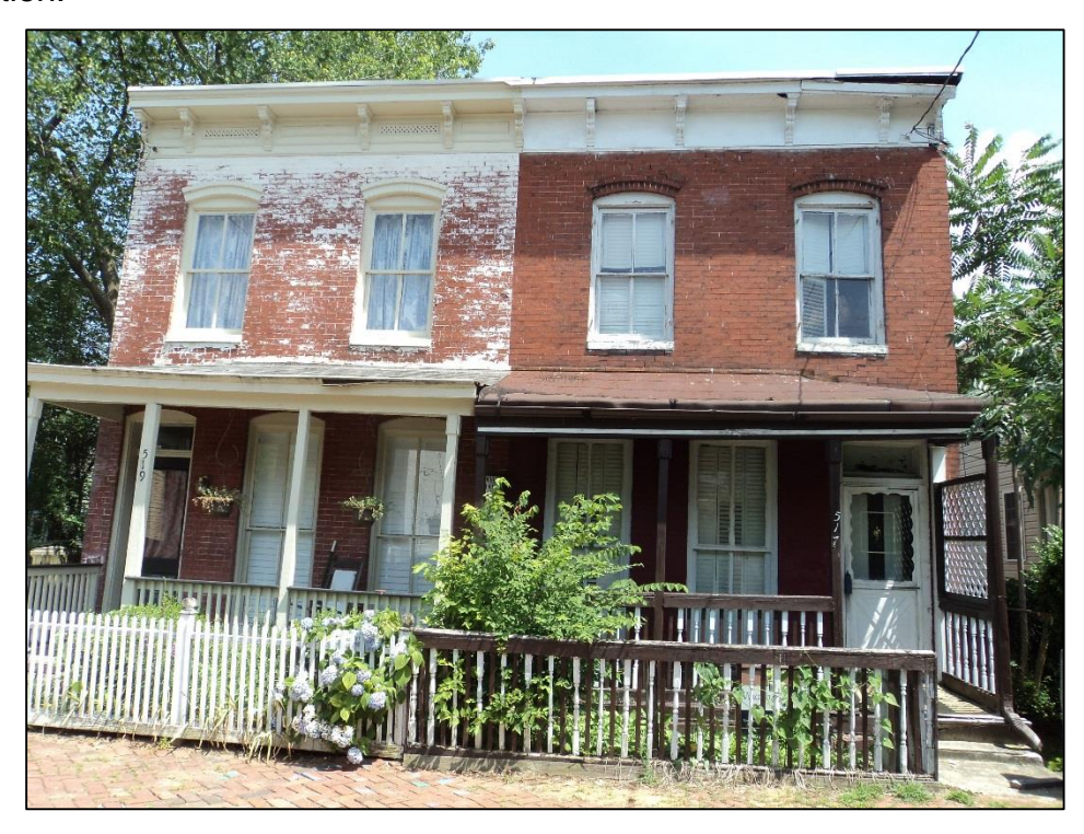
517 N. 26th Street.

The existing one-story addition on the rear appears to have been enlarged with unsympathetic materials and modern windows and a door. It is currently in fair condition.