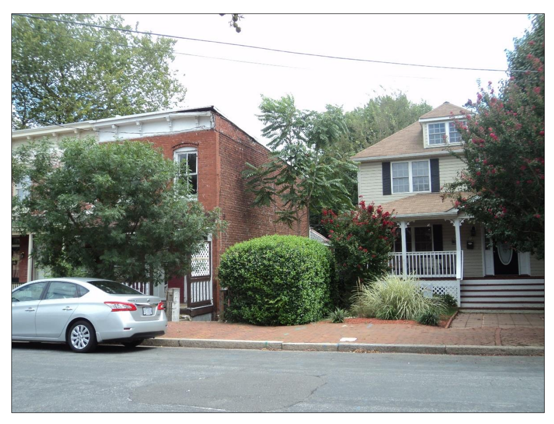
517 N. 26th Street - Right Elevation.