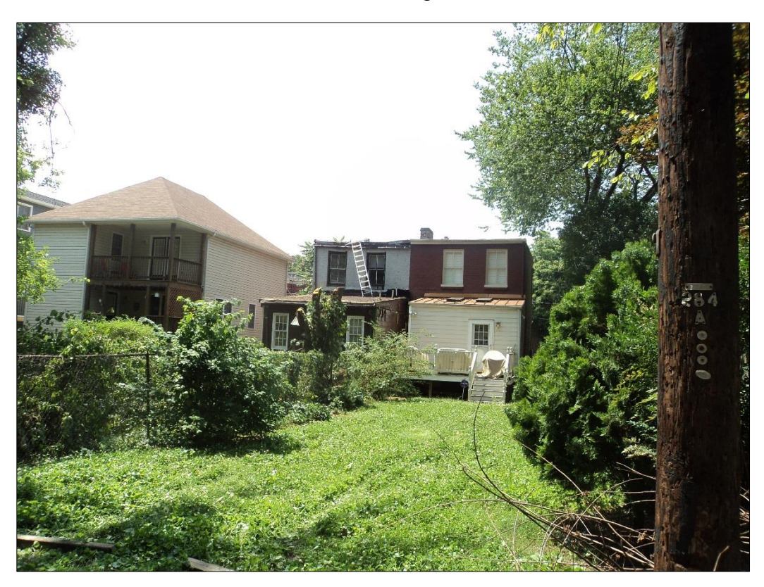
517 N. 26th Street - Rear Elevation.