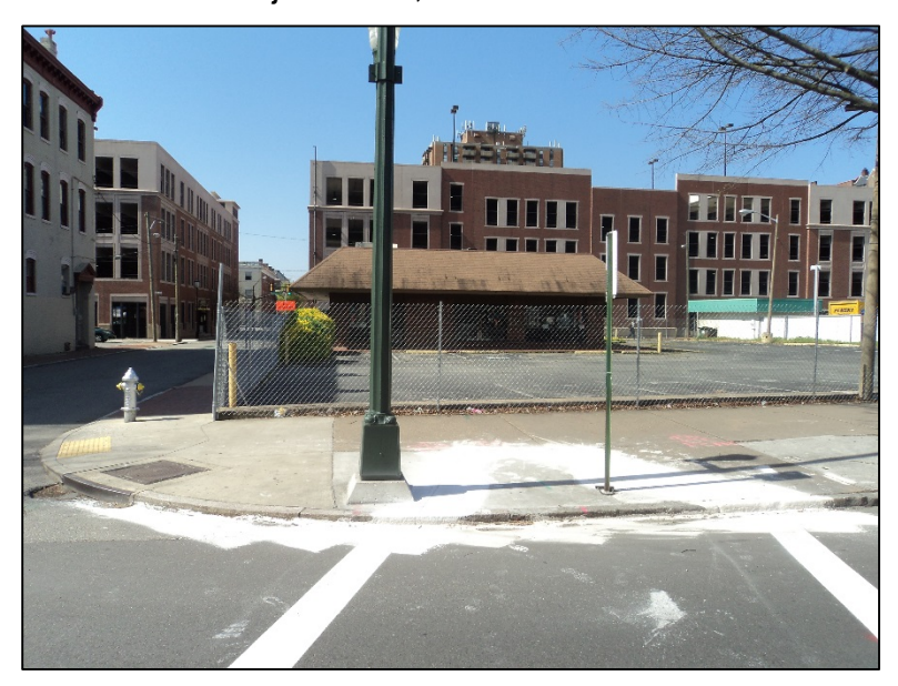
501 West Broad Street (April 2018)

Description of Existing Structure: The existing structure is a vacant, single story, masonry, commercial structure constructed in 1969. The structure was a fast food restaurant and sits on southern corner of the lot along North Henry Street. The remainder of the lot is developed with a parking lot with limited vegetative screening. In June of 2015, the Commission approved the demolition of a gas station at the adjacent lot, 535 West Broad Street.