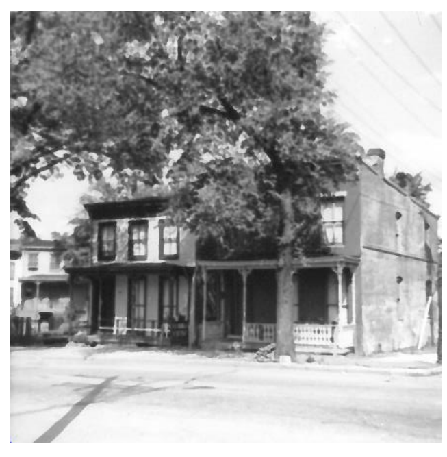
Historic Richmond Foundation Survey, 1977

located a photograph of the dwelling from 1977 which clearly shows two-over-two windows in the front of the structure.