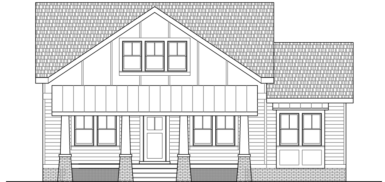
CONCEPTUAL ELEVATION 'A'