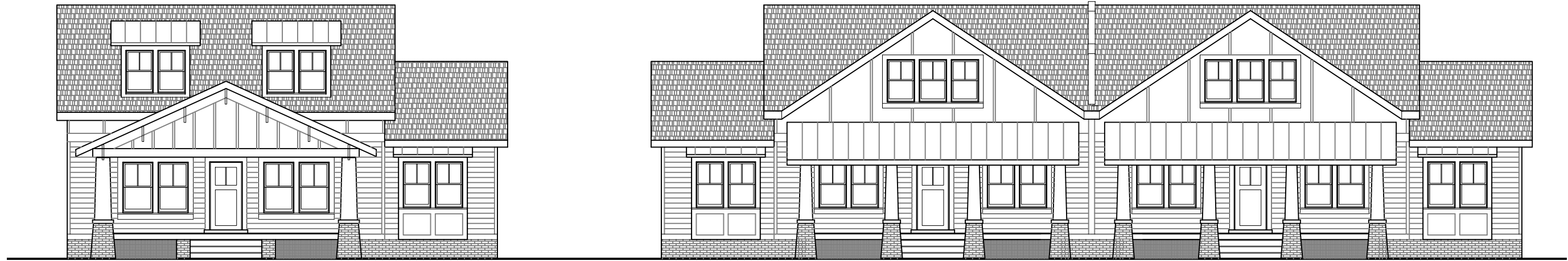
CONCEPTUAL STREET ELEVATION WITH DETACHED & ATTACHED UNITS