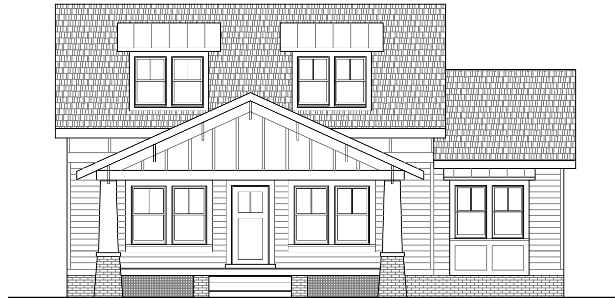
CONCEPTUAL ELEVATION 'B'