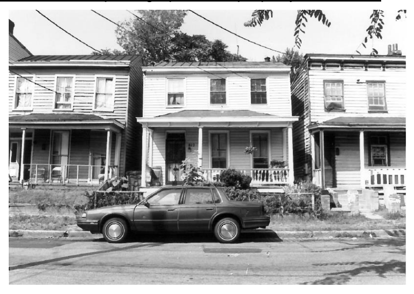
812 Jessamine Street (Historic District Survey 1993)

Porch: The Commission approved the restoration of the porch with composite materials based on photographic evidence in February 2017. The Guidelines note that replacement porches should match the original as much as possible (pg. 69, #5). Staff supports the use of wooden materials for the restoration of porch with the conditions that dimensions of the proposed decking boards be provided for administrative review and approval and the balusters be turned to match those shown in the photograph of the property from 1993.