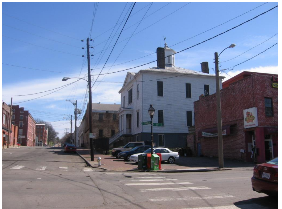
View from the intersection of N. 18<sup>th</sup> and E. Franklin streets looking southeast