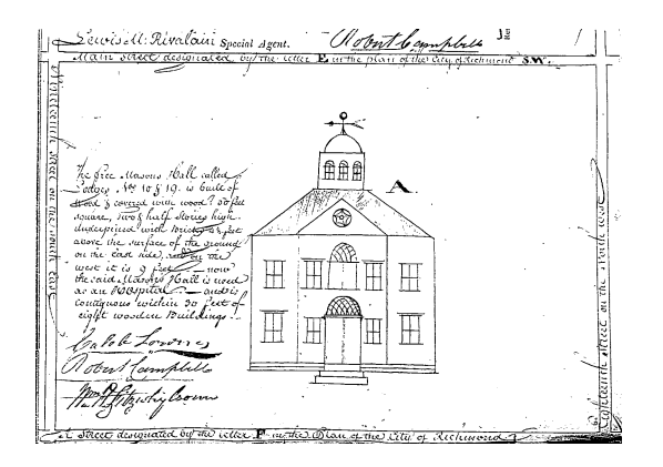
Sketch from 1814 Mutual Assurance Policy

The Mason's Hall, Richmond-Randolph Lodge No. 19, is located in the National Register-listed Shockoe Valley and Tobacco Row Historic District and is individually listed on the Virginia Landmarks Register and the National Register of Historic Places. It is directly across Franklin