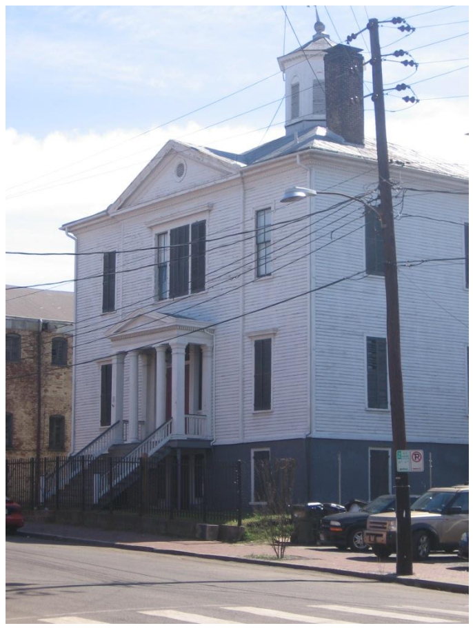
Northwest Corner looking southeast