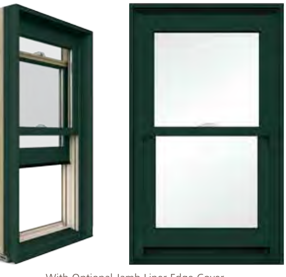
With Optional Jamb Liner Edge Cover