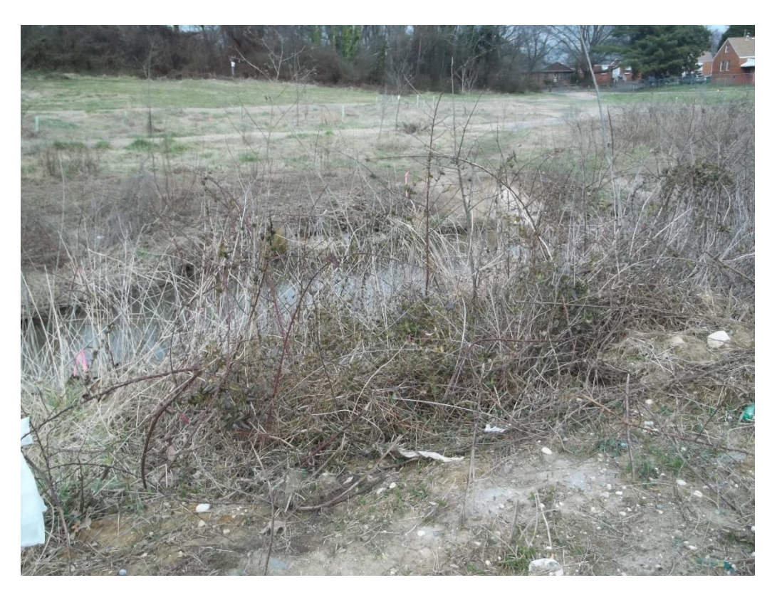
Most of the vegetation along right bank is a "volunteer" blackberry thicket that is starting to be over-run by invasive Japanese honeysuckle.