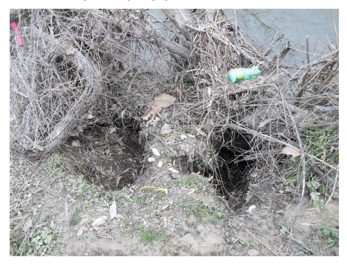
Erosion occurring behind buried root balls embedded in the left bank.