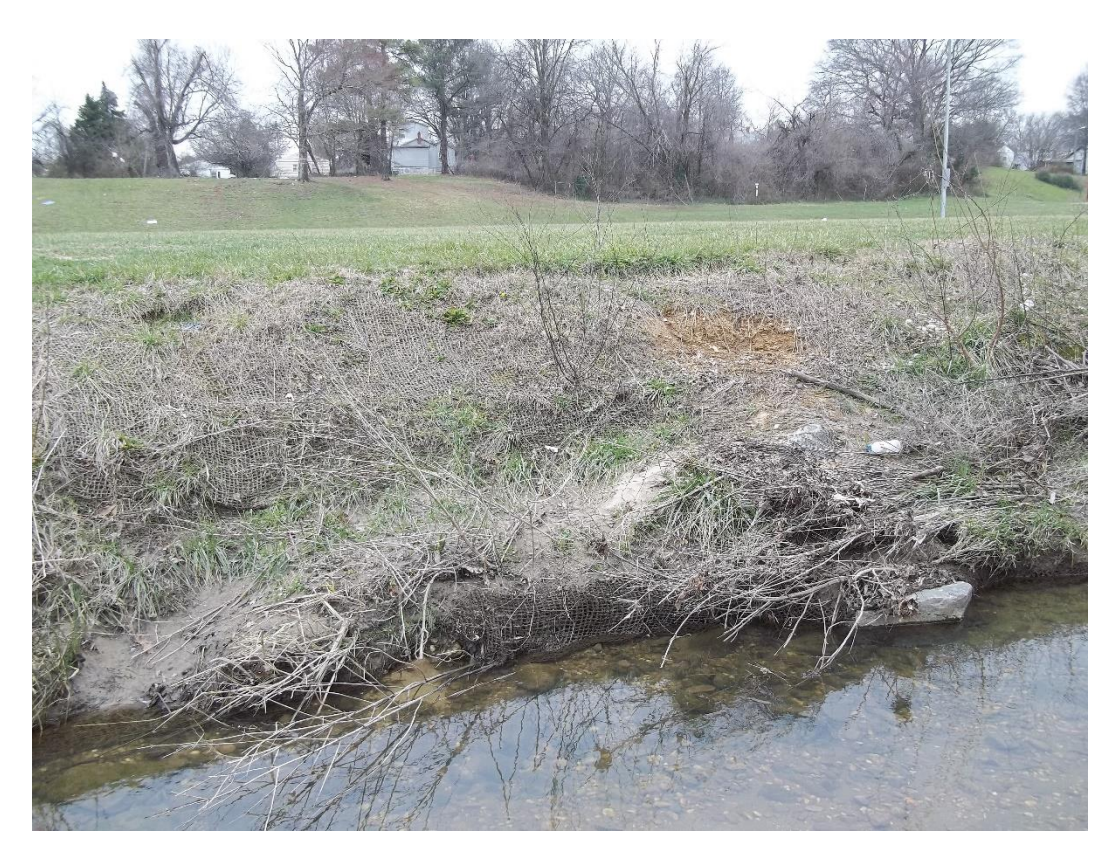
Erosion and damaged matting along right bank.