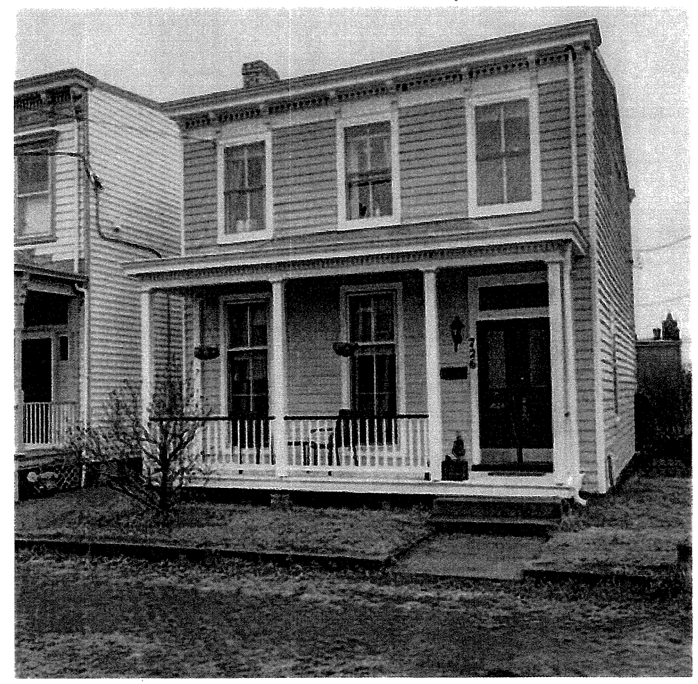
726 N 27H ST