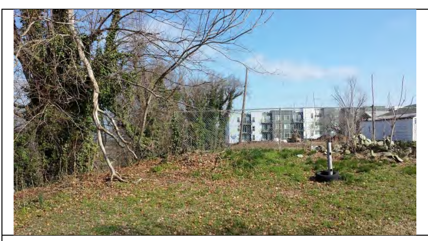
1902 – 1904 Princess Anne Ave.