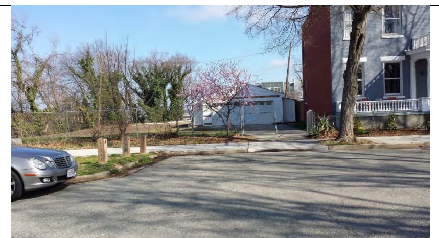
1908 Princess Anne Ave.