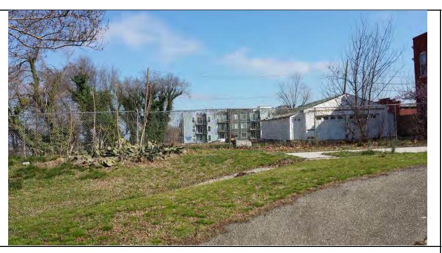
1906 Princess Anne Ave.