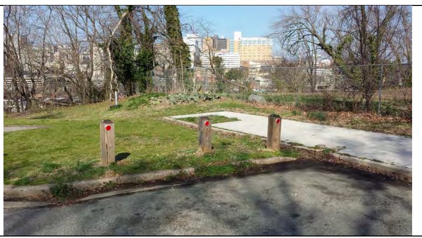
End of Princess Anne Ave.