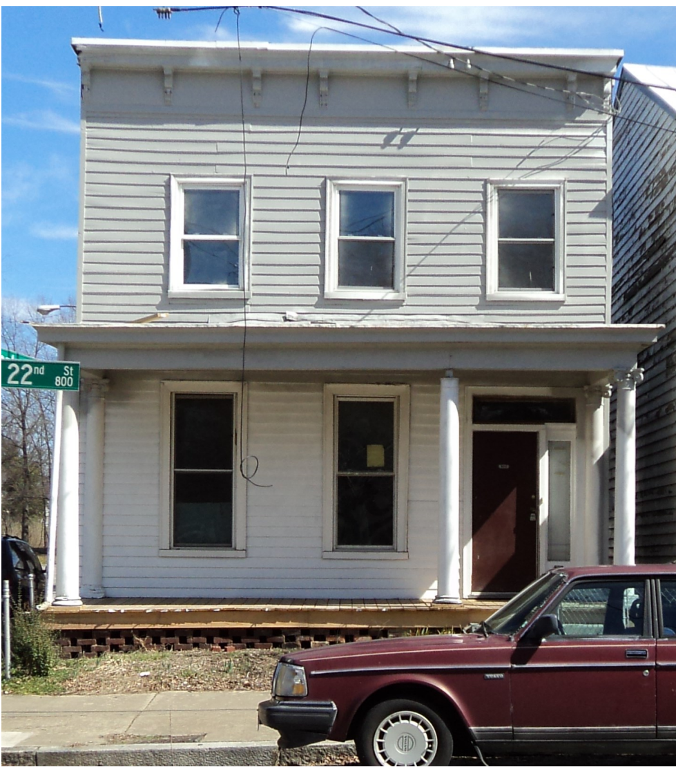
873 N. 22nd Street with original turned balustrade (Google Street View July 2011)