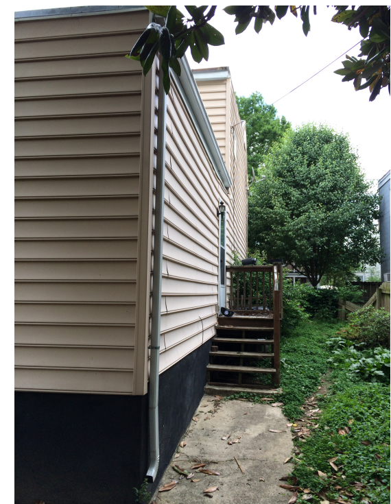
AS BUILT SIDE - WEST ELEVATION