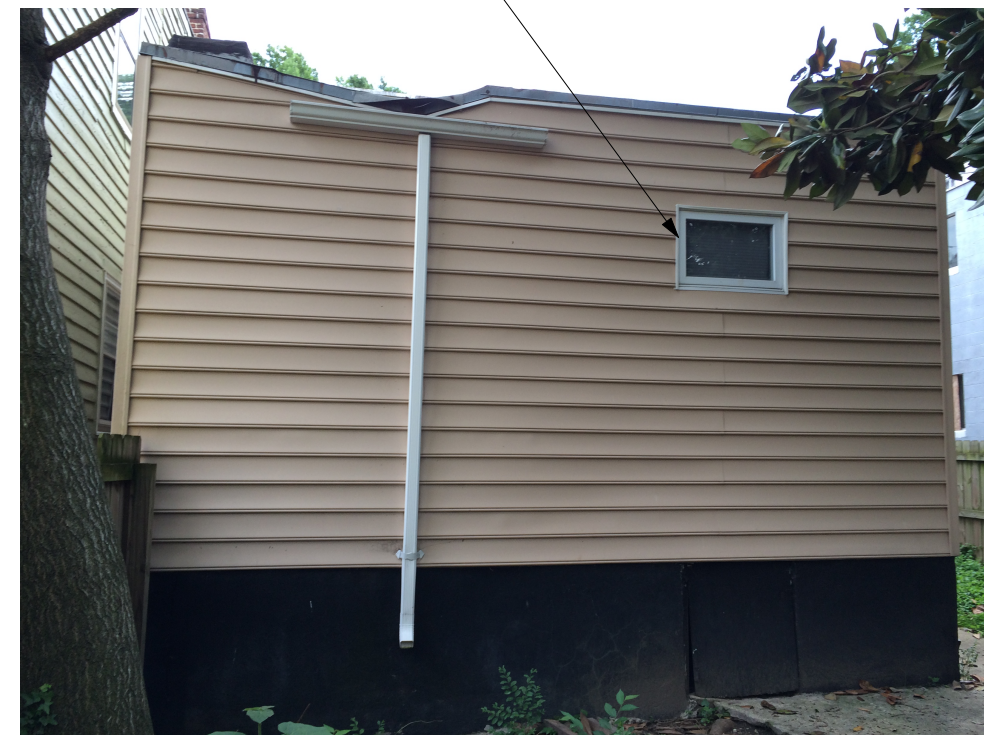
AS BUILT REAR - NORTH ELEVATION