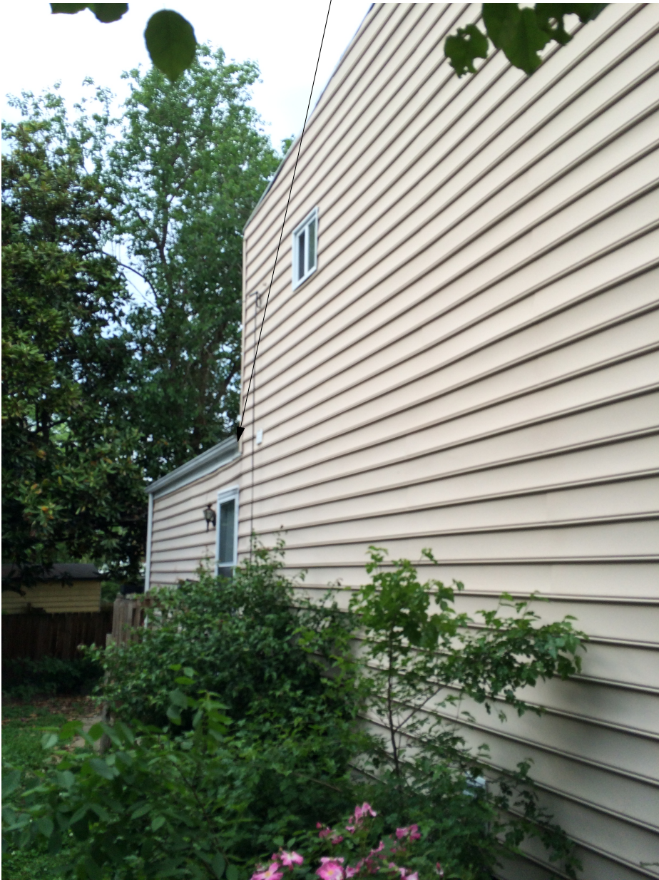
WEST SIDE ELEVATION