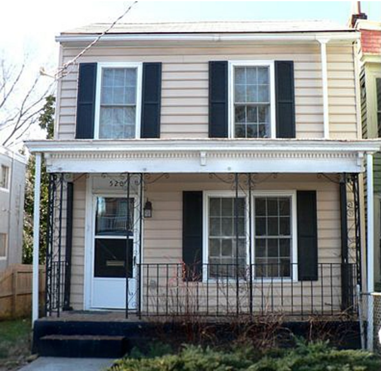
SOUTH FRONT ELEVATION NO PROPOSED CHANGE