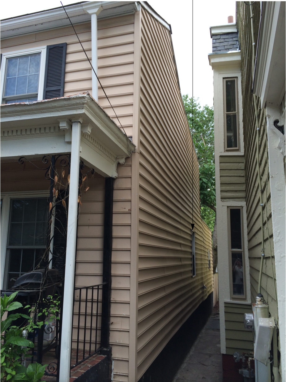
EAST SIDE ELEVATION