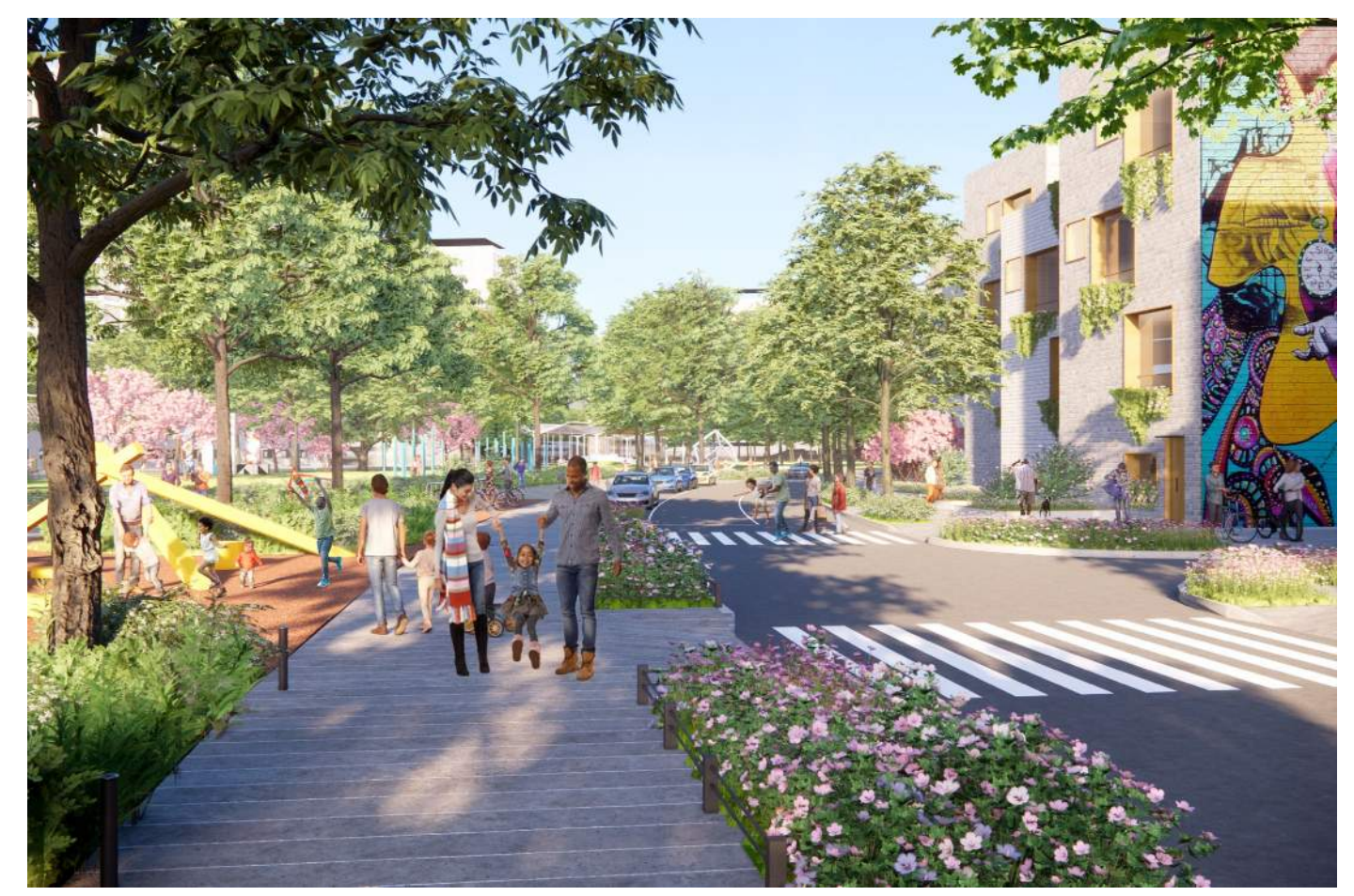
Illustration of the redevelopment of the Diamond District

Rezoning the Diamond District to amend the TOD-1 district, establish and map the Stadium Signage Overlay district