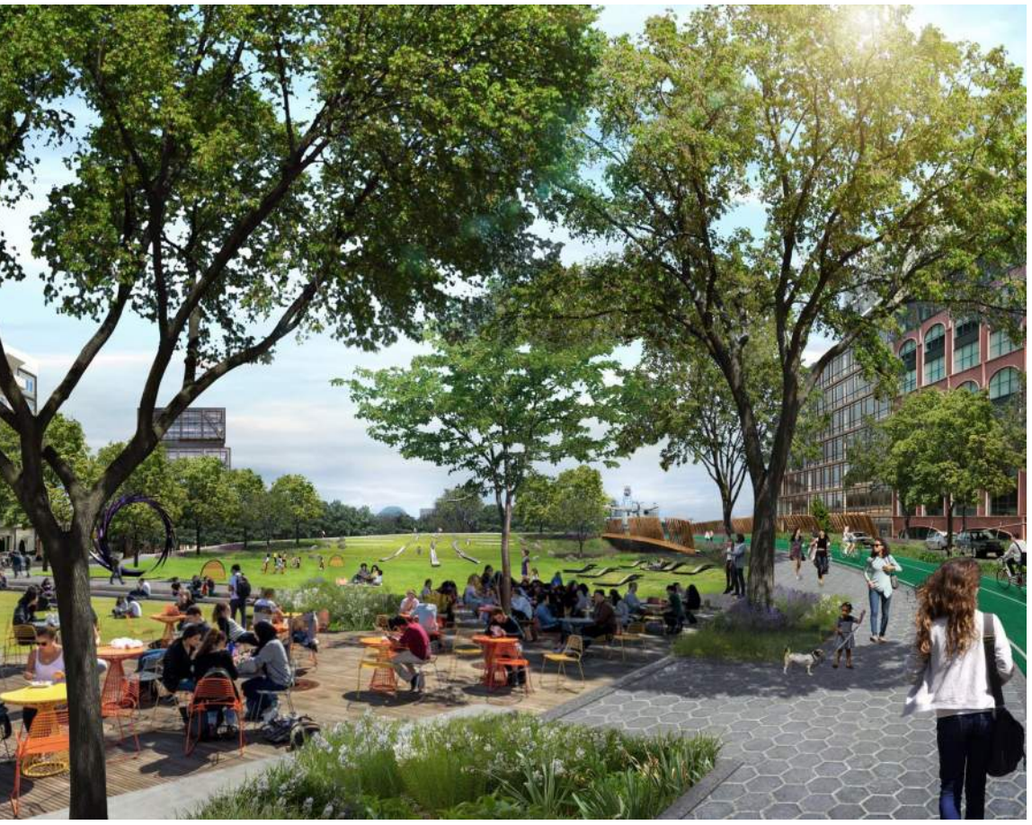
Illustration of the Crescent Park envisioned in the Greater Scott's Addition Framework Plan

May 8, 2023: Council considers authorizing the conveyance of the property and Development Agreement