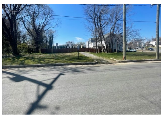
Figure 6. New construction at Carrington & Pink Streets

Figure 4. 1014 & 1016 Russell - vacant lots