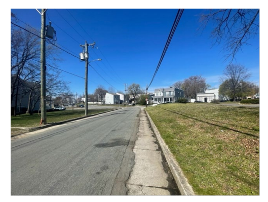
Figure 2. Looking north on Russell Street