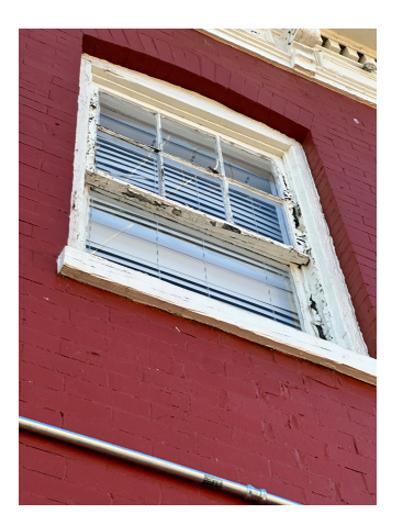
2nd floor left window