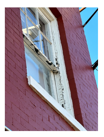
2nd floor right window