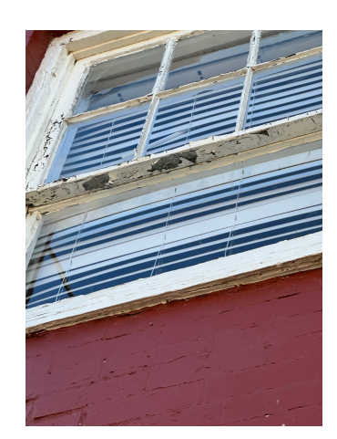
2nd floor center window