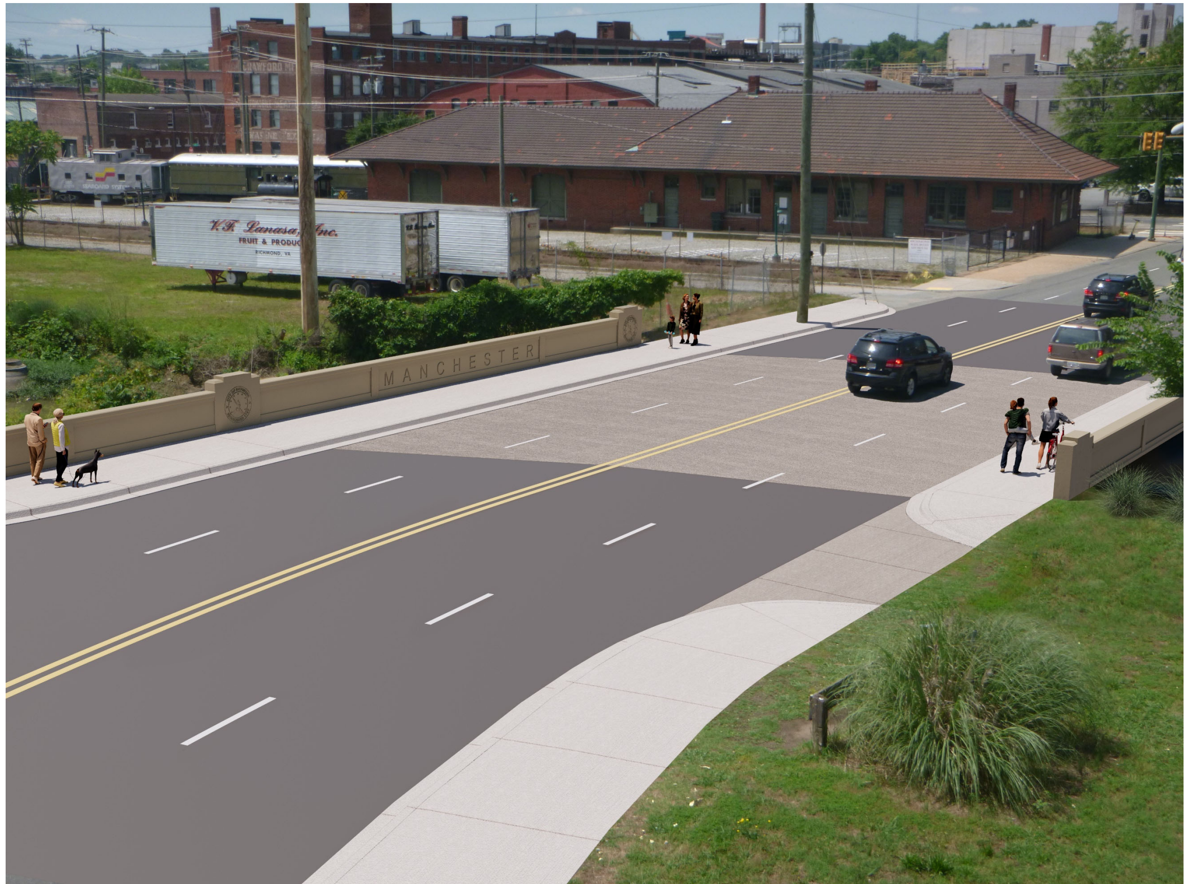
Figure 1 - View from Floodwall