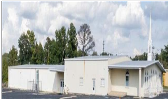
Liberation Church 5501 Midlothian Turnpike