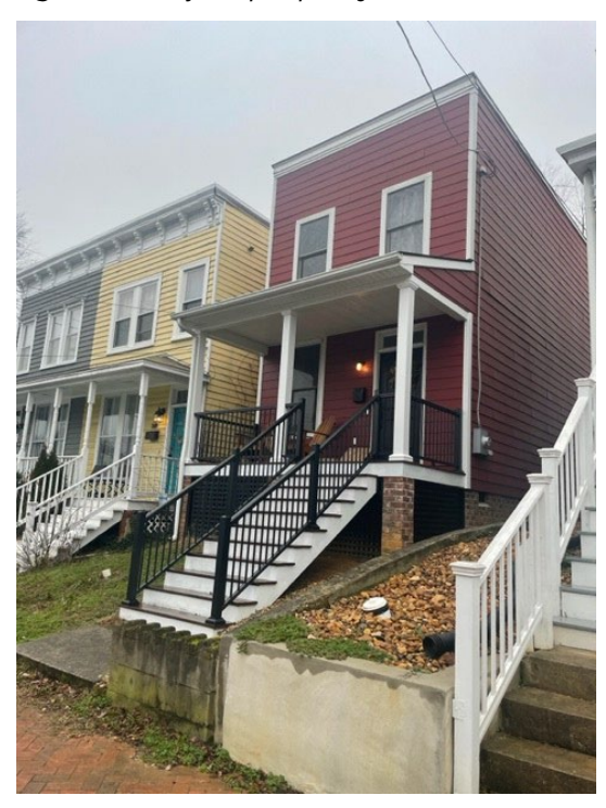
Figure 1. Subject property