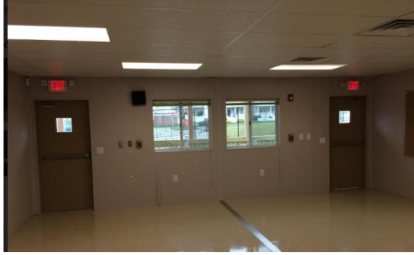
Typical Building Interior

If further information is required, or if clarification is desired, please contact Lloyd Schieldge directly via cell phone, at 804.510.4758, email, at lschield@rvaschools.net , or Bobby Hathaway via cell phone at 804.325.0740, email, at Rhathawa@rvaschools.net