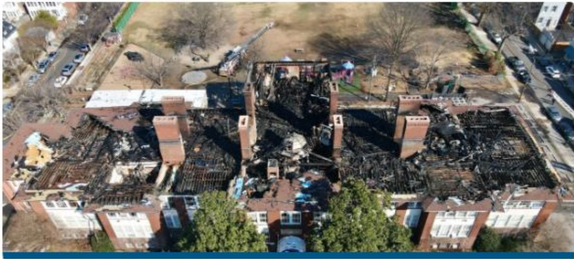
Photograph of charred remains of Fox Elementary School at 2300 Hanover Street, Richmond, Virginia

On Friday, February 11, 2021, the City of Richmond experienced a devastating fire at Fox Elementary School, within a few days of the fire, the building was condemned, and the school went into virtual learning mode. On Monday, March 21, 2022, staff and students were relocated to the then vacant First Baptist Church School, roughly eight blocks away. The Fox School remained at First Baptist until the former shuttered RPS Clark Springs could be readied to welcome them on Monday, May 9, 2022. The plan is to keep staff and students at this location until such time Fox Elementary School is rebuilt or otherwise replaced.