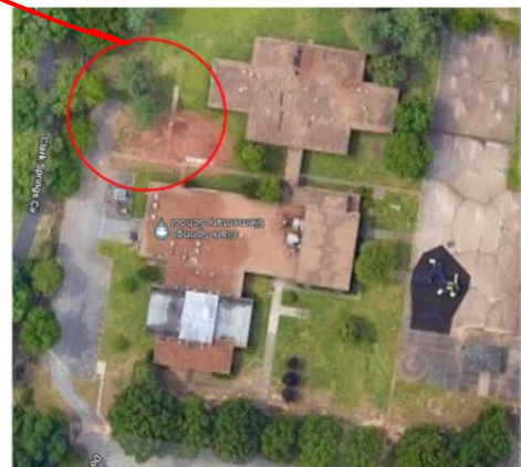
Aerial View of Existing Clark Springs Elementary School

RPS desires to get these units ready for occupancy by the beginning of this school year, or as close to the start date as possible. The first day of school this year is Monday, August 29, 2022, please note teachers would also like at least a few days to setup their classrooms. These modular classrooms are expected to remain on site for a period of two years, or such time more or less as required to either repair or replace the existing Fox Elementary School at 2300 Hanover Avenue, Richmond, VA.