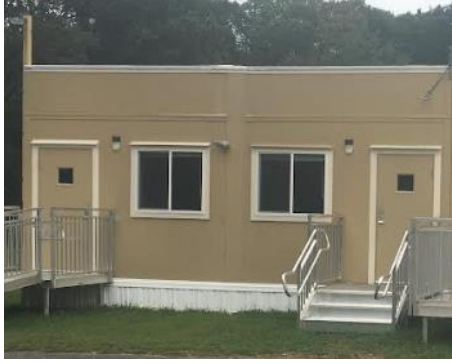
Typical Building Exterior