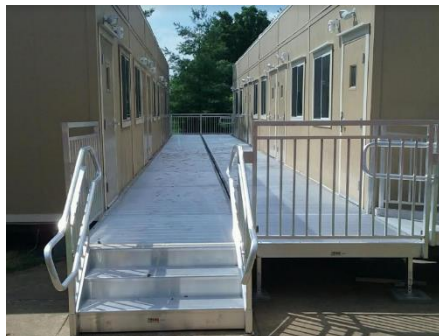
Typical Lease Metal Deckin/Stairs