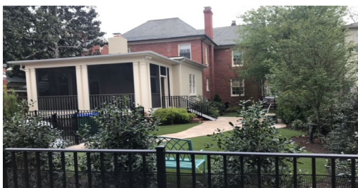
Figure 3. Existing rear aluminum fence. CAR Files, Feb. 2019