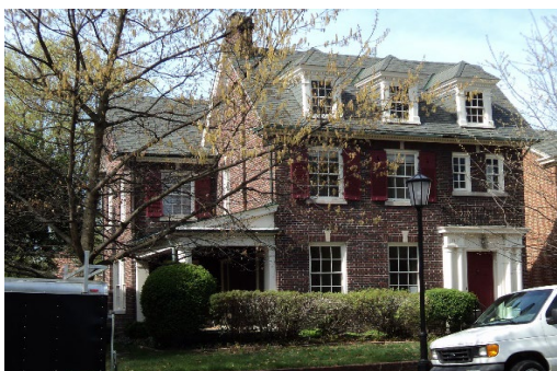
Figure 1. Façade photo