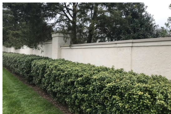
Figure 2. Example stucco wall