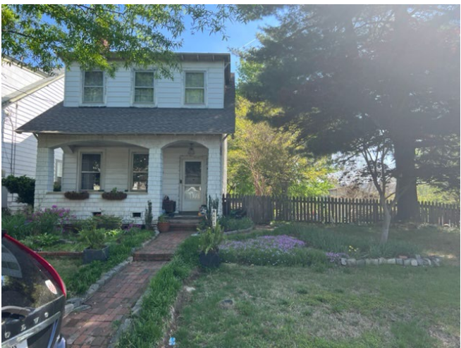
Figure 2.Existing Dwelling at 603 W. 19th