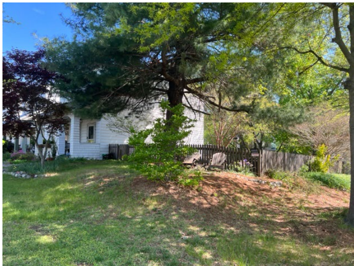
Figure 3. View of subject properties from corner