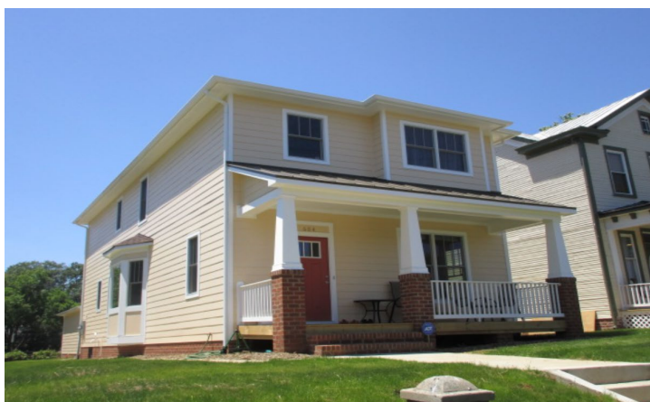
Figure 1. Façade photo