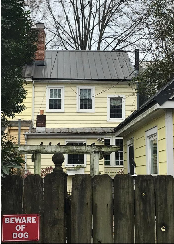
Figure 1. Existing rear elevation, 506 North 27th Street