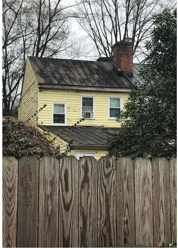
Figure 2. Existing rear elevation, 508 North 27th Street