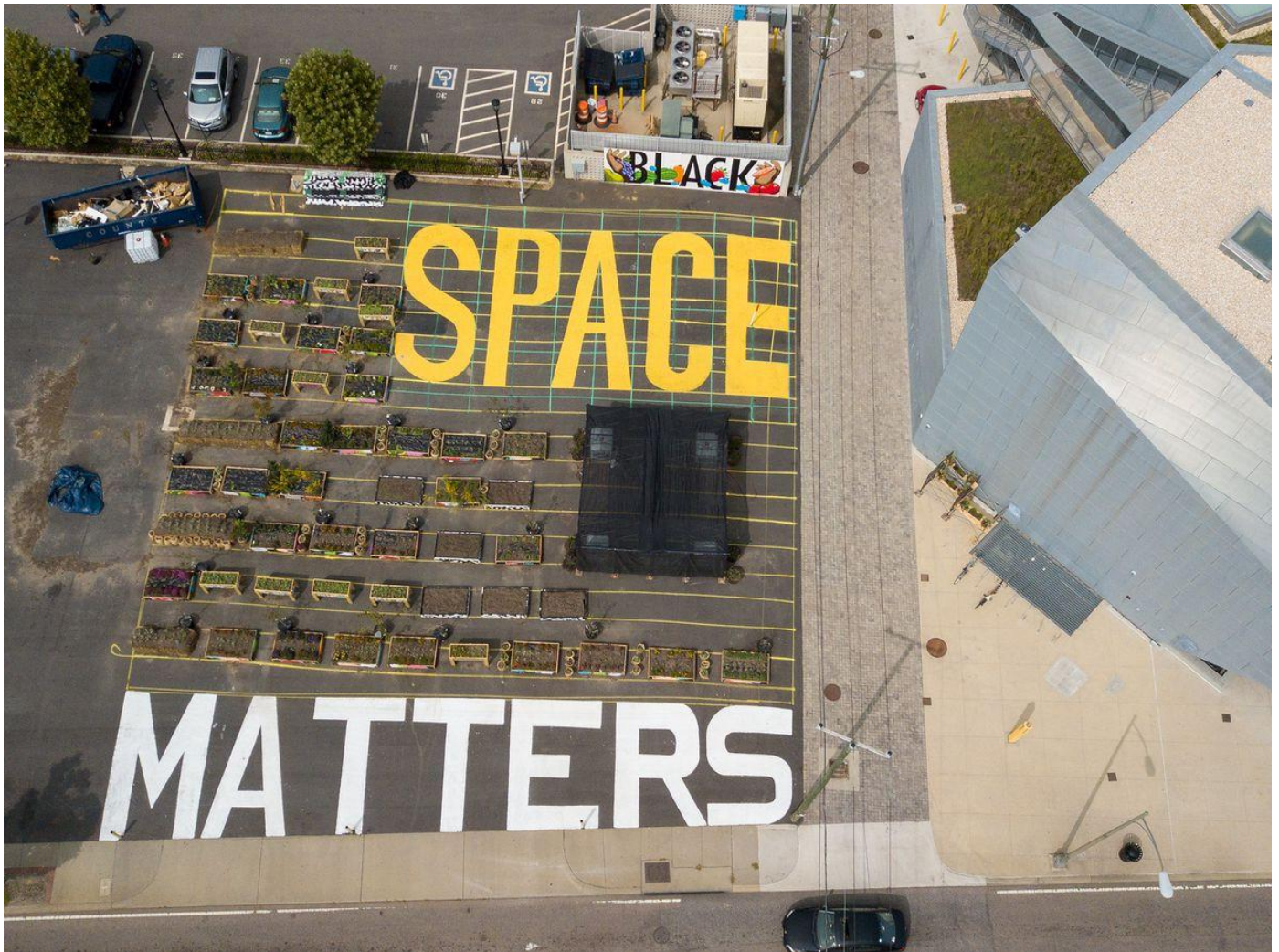
"Black Space Matters"