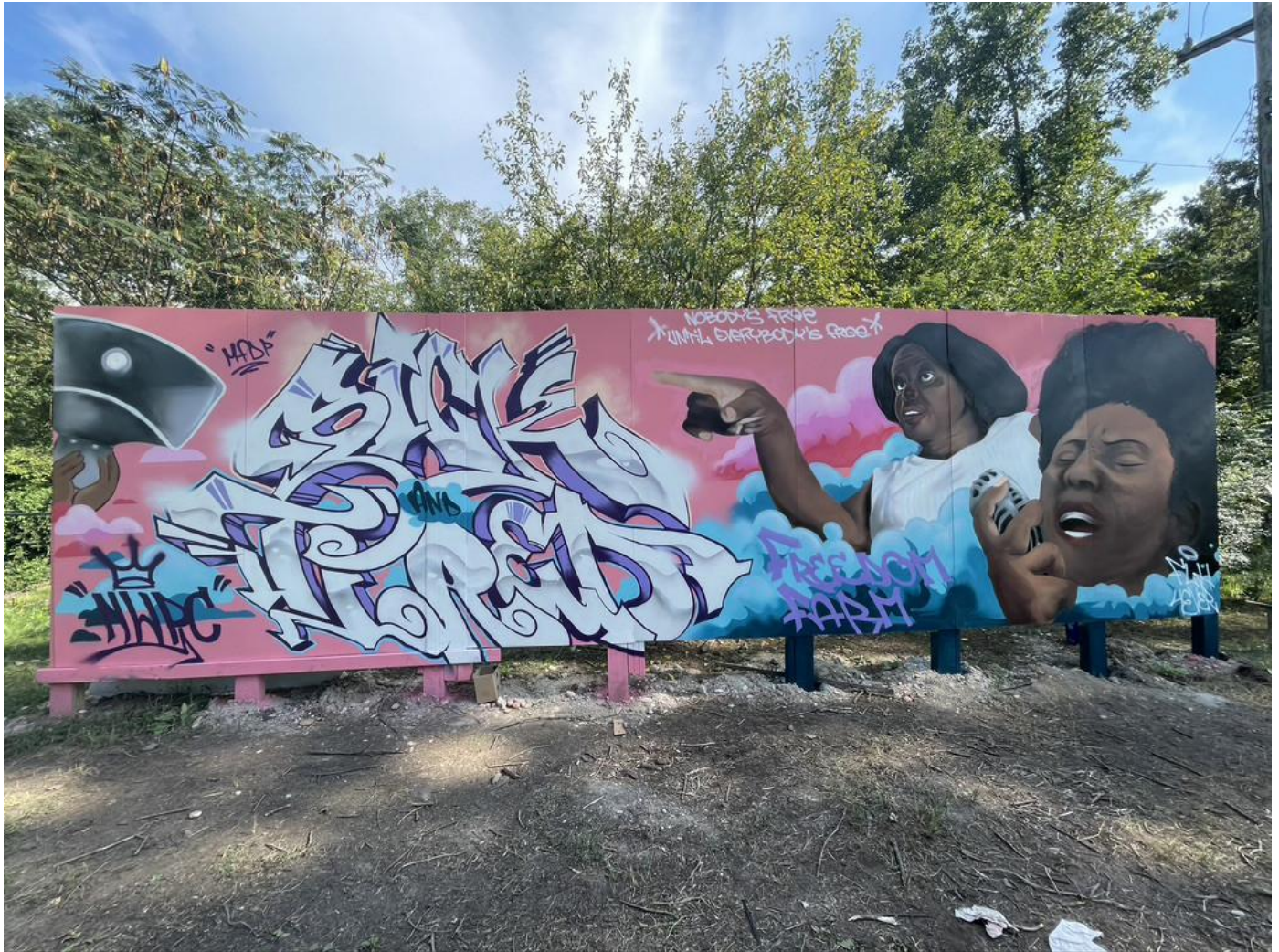
"Sick & Tired"