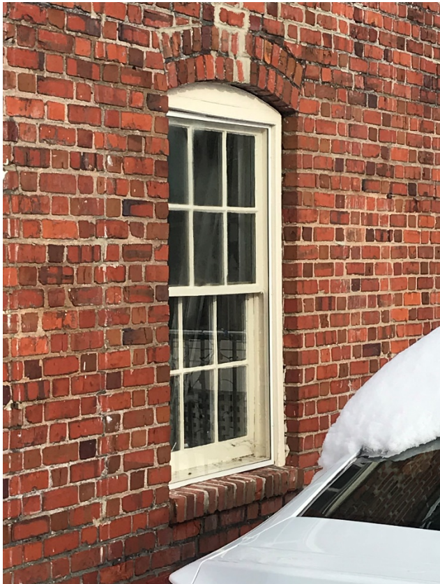
Figure 3. Garage window detail