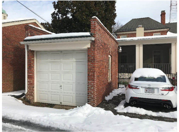
Figure 2. Garage at 3317 Monument Ave