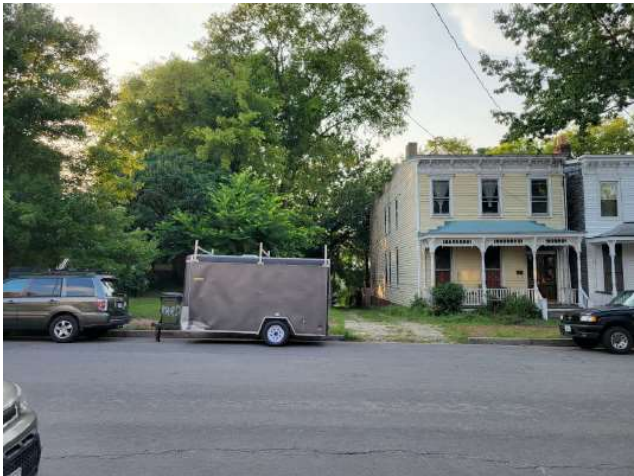
Figure 2. Current vacant lot.