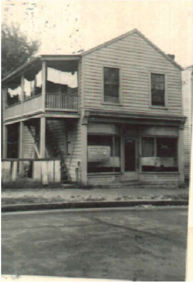
Figure 4. Historic photo from Assessor's office (demolished 1996).