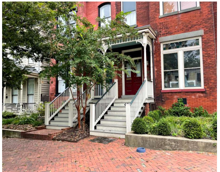
Figure 7. Examples of elevated front porches on N. 23 rd Street