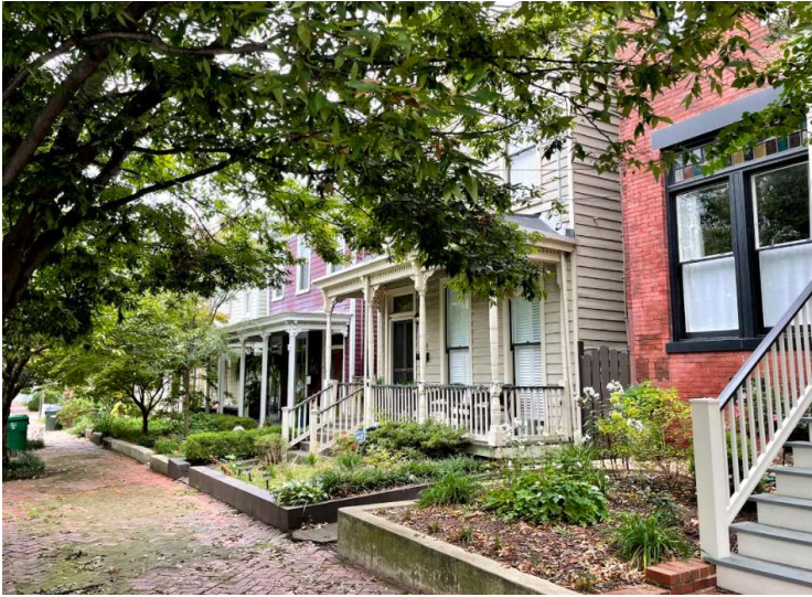
Figure 8. Examples of un-aligned front porch cornices on N. 23 rd Street