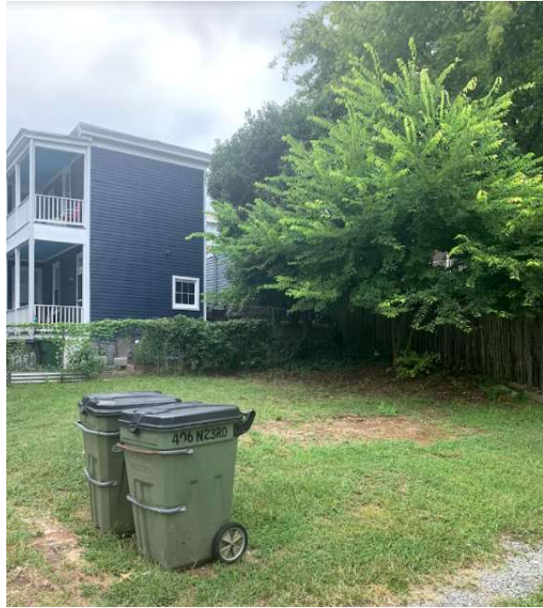
Figure 5. Current view of vacant lot looking south towards E. Marshall St.