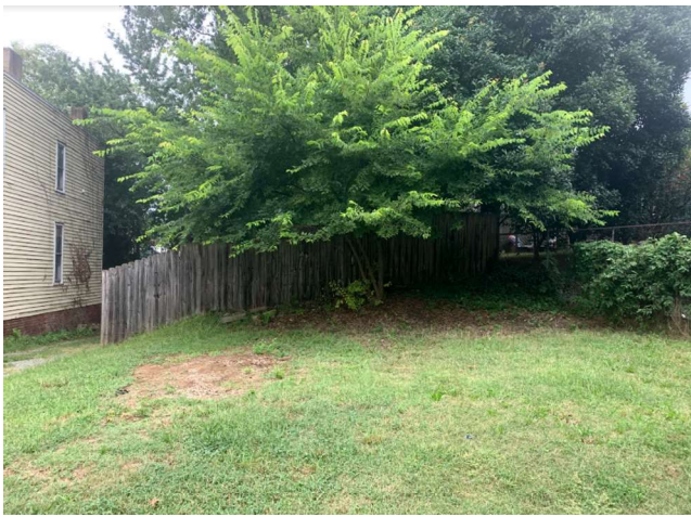
Figure 6. Current view of vacant lot facing N. 23 rd St.