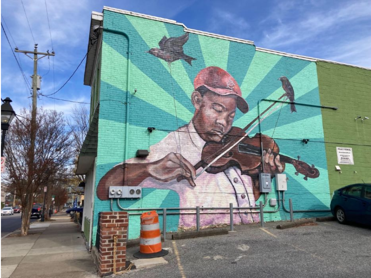
25th Street/Church Hill North