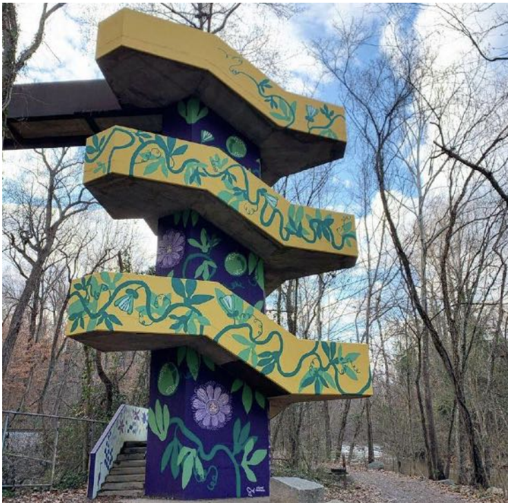
James River Park System Tower, painted 2022 with teens.