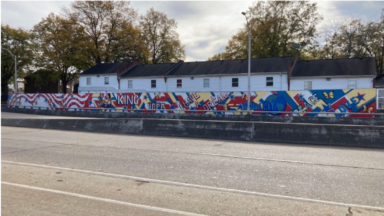
MLK Bridge/Leigh Street Viaduct at "O" Street

Adjacent to Union Hill Old & Historic District: