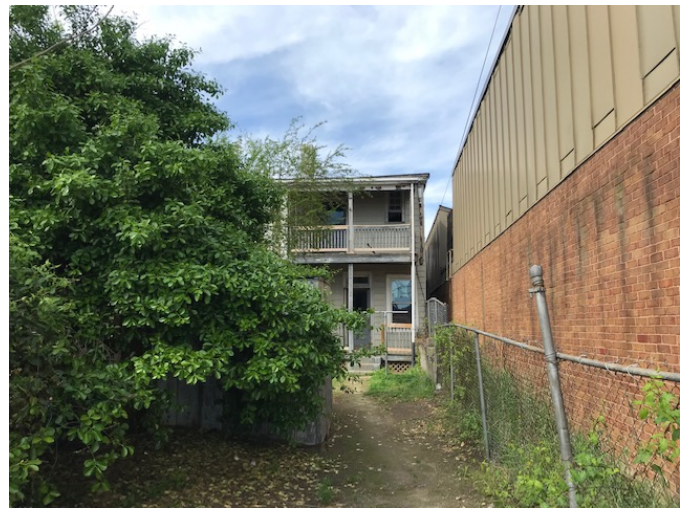
Figure 2. Rear elevation