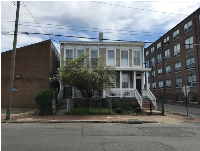
Figure 1. Façade