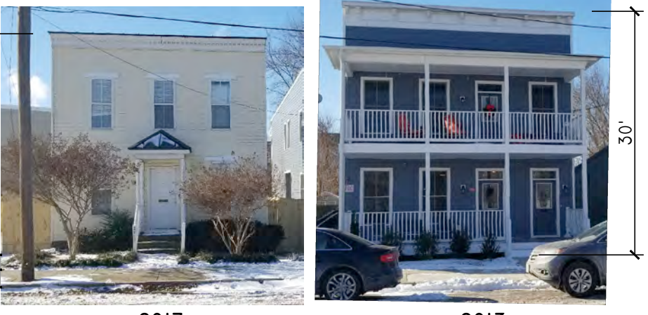
03 | M ST. CONTEXT ELEVATION 1/16" = 1'

PROJECT CONTACTS: ARCHITECT: CHRIS WOLF ARCHITECTURE, PLLC 804-514-7644