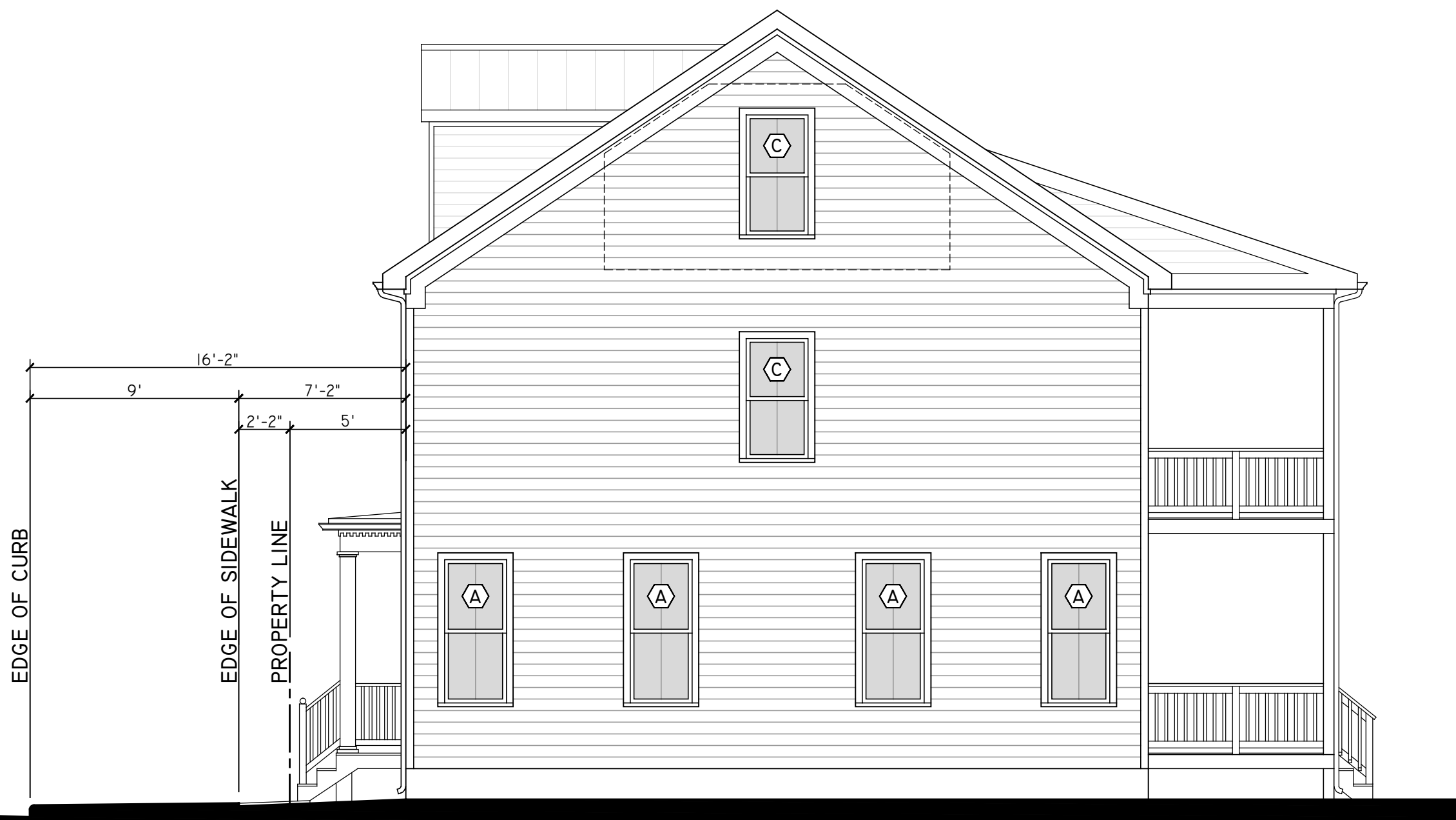
02 RIGHT SIDE ELEVATION (M ST.)