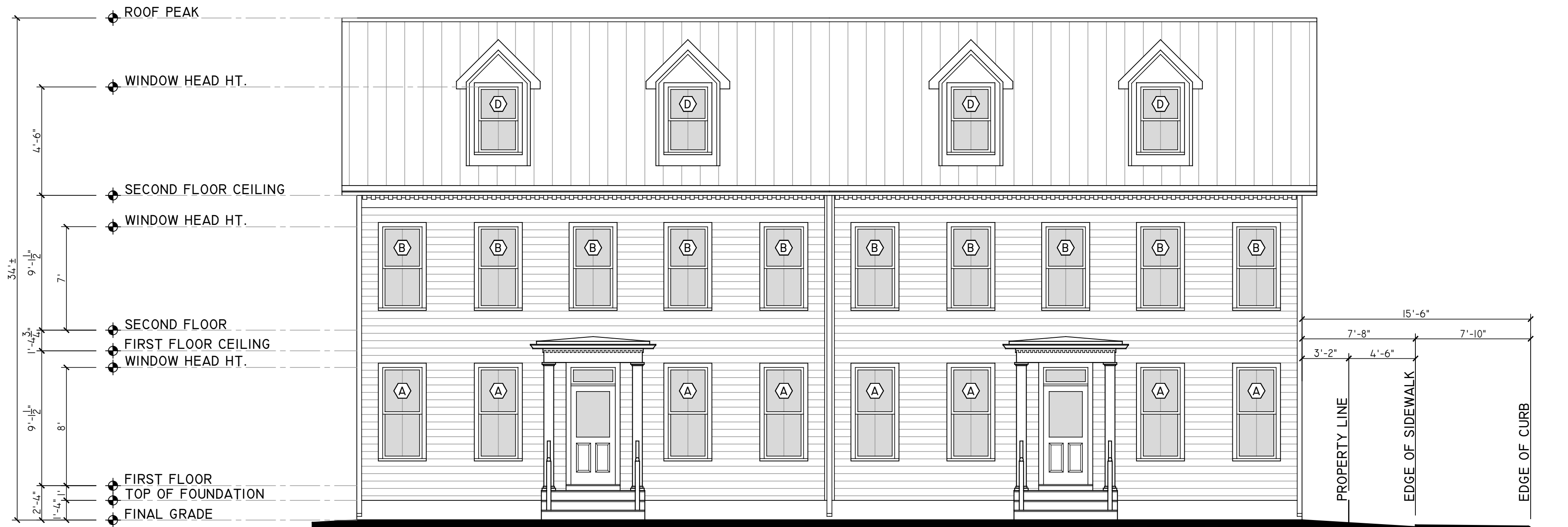
01 FRONT ELEVATION (N. 29TH ST.)