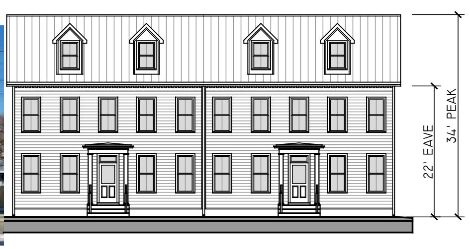
02 | N 29TH ST. CONTEXT ELEVATION 1/16" = 1'