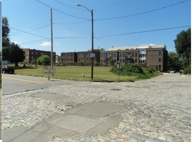
Figure 2. 2117-2219 Carrington Street.