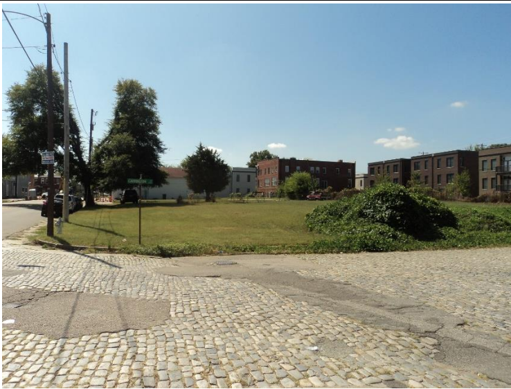
Figure 1. 2117-2119 Carrington Street.