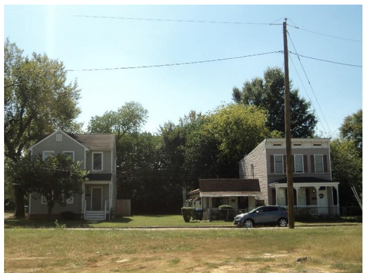
Figure 4. 2200 Block of Carrington Street.