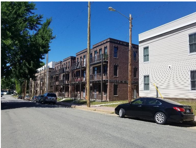
Figure 3. New construction on the same block, facing Jessamine Street.