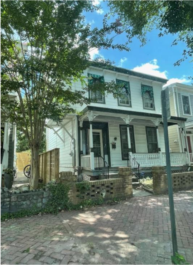
Figure 7. View of north side of house which will contain part of addition