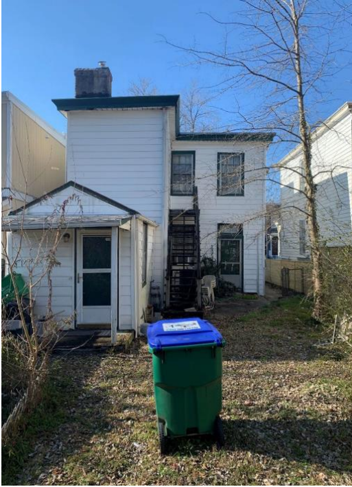
Figure 3. Existing rear façade