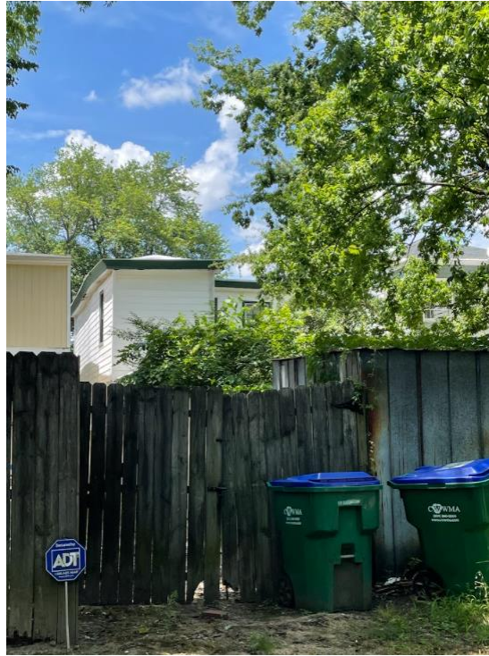
Figure 4. Photo from rear taken in alley