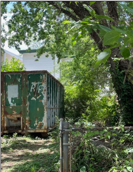
Figure 5. Photo from rear taken in alley