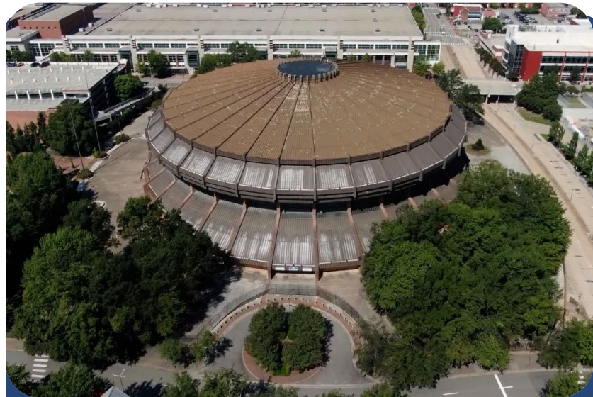
Coliseum Demo, Hotel, and Parking

Major Redevelopment Projects Anchoring City Center and the Broad Street Corridor