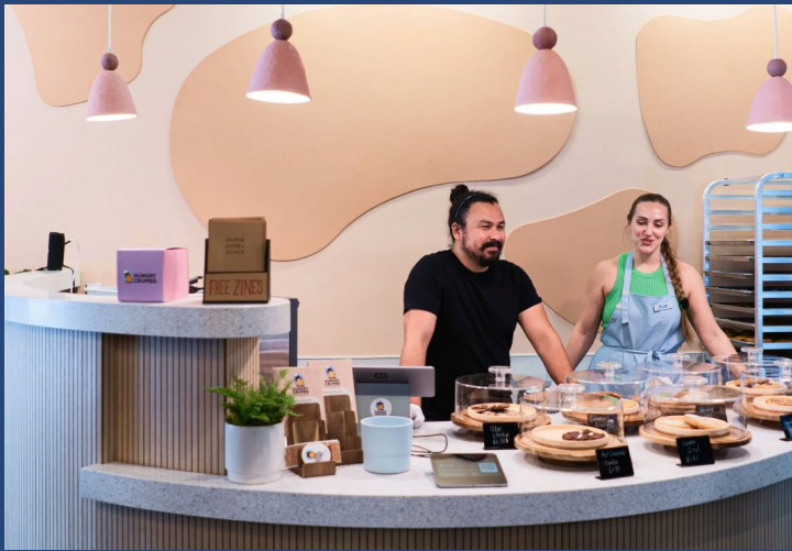
Pop up Concepts