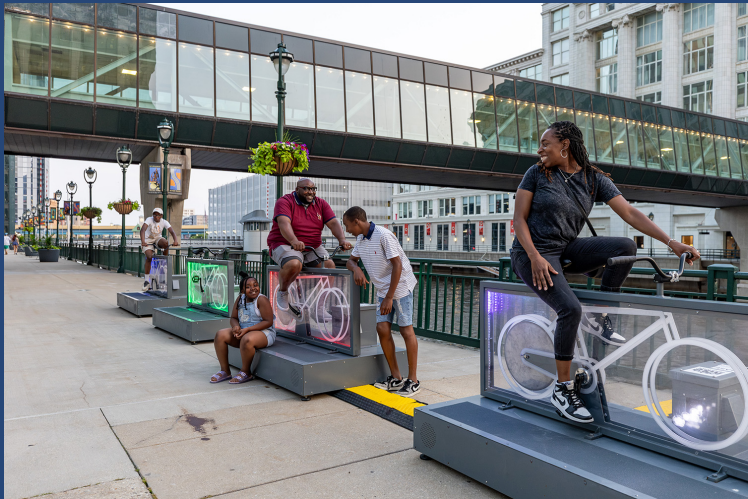
Parking Lot Activation