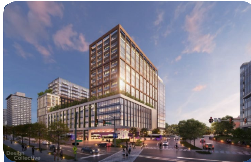
GRTC Transit Hub

Ordinances 2025-284 and 2025-285 are key steps in activating the City Center pipeline