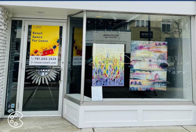
Storefront Art Displays